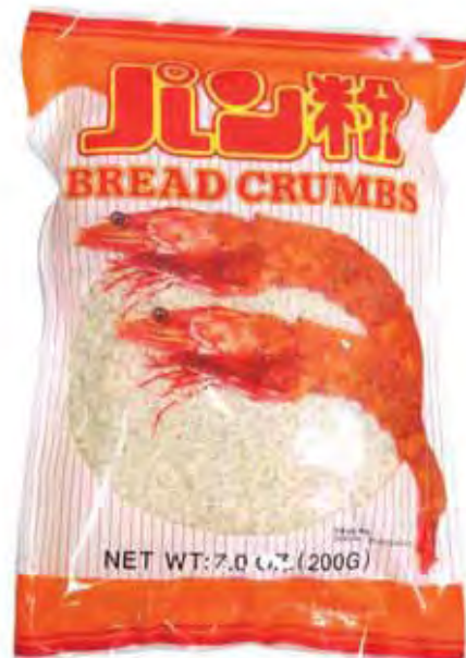
18052 JAPANESE BREAD CRUMBS