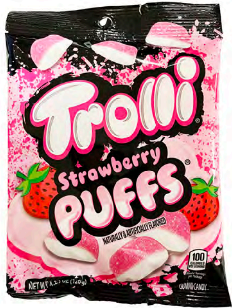
11252 TROLLI STRAWBERRY PUFFS