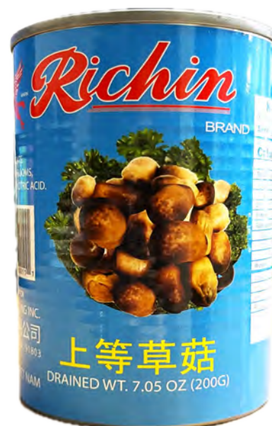
10011 RICHIN UNPEEL MUSHROOM