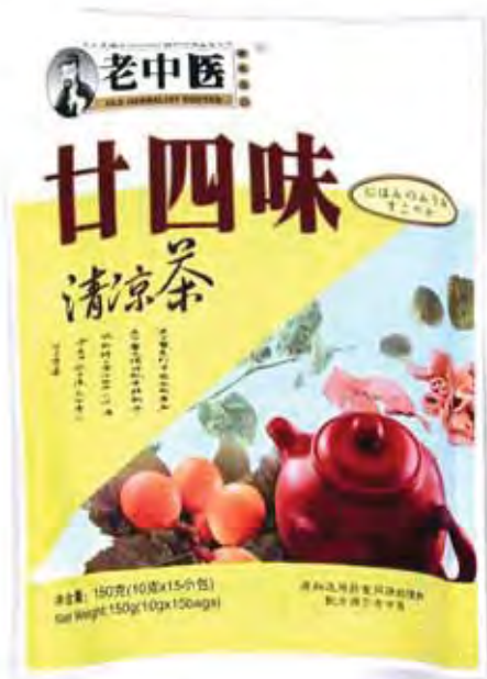
21065 20X15X10GR. 24 FLAVOR HEABAL TEA