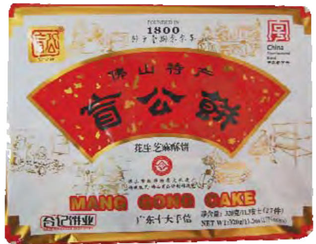
12112 MANG GONG CAKE