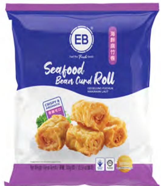
17036 SEAFOOD BEANCURD ROLL