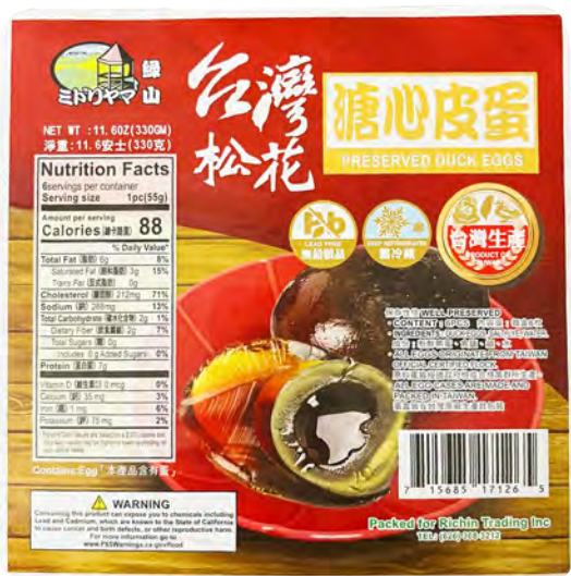
17126 GM PRESERVED EGG