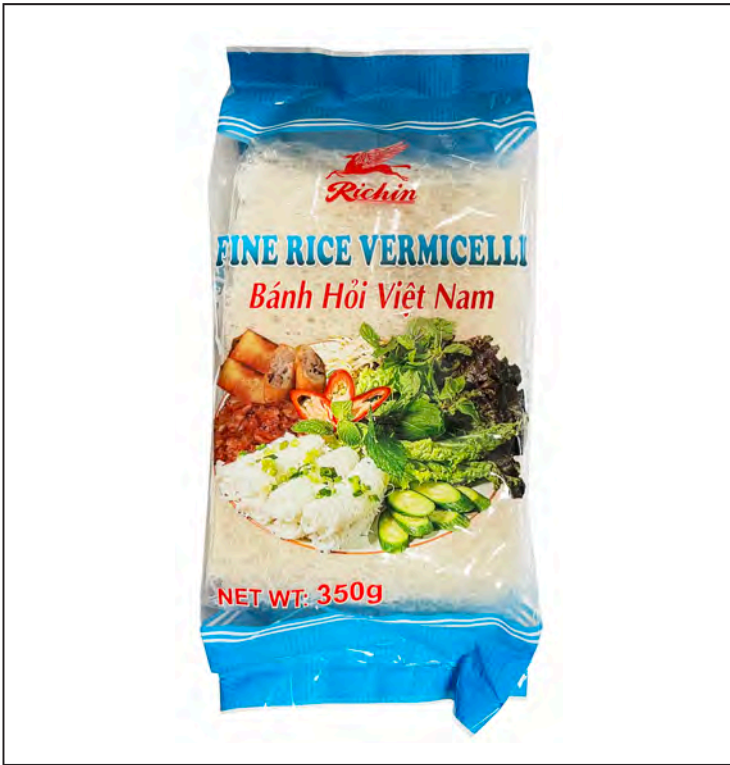
18282 40X350G. RICHIN VIET FINE RICE VERMICELLI