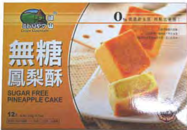
12101 PINEAPPLE CAKE (SUGAR FREE)