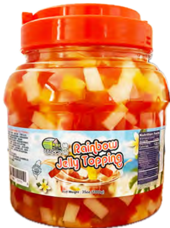
12155 12X1000G. JELLY TOPPING COMPOSITE