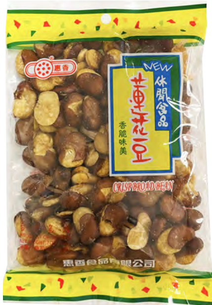
19026 CRISP BROAD BEAN (REG)