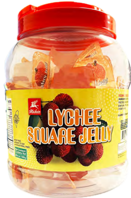
12163 6X1400G. RICHIN LYCHEE SQUARE JELLY