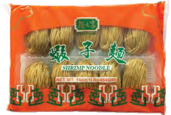
18123 20X16OZ. IMITATION SHRIMP NOODLE(S)