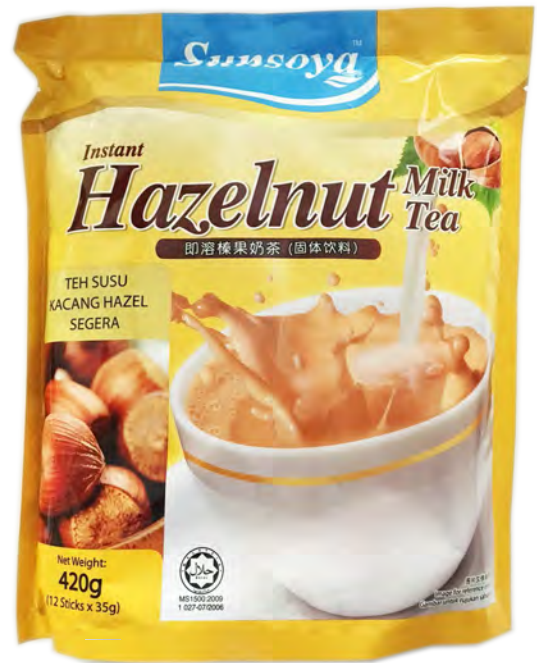
21166 24X12X35GR.. INSTANT HAZELNUT MILK TEA