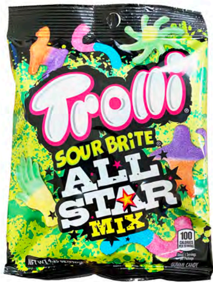
11267 TROLLI ALL-STAR MIX