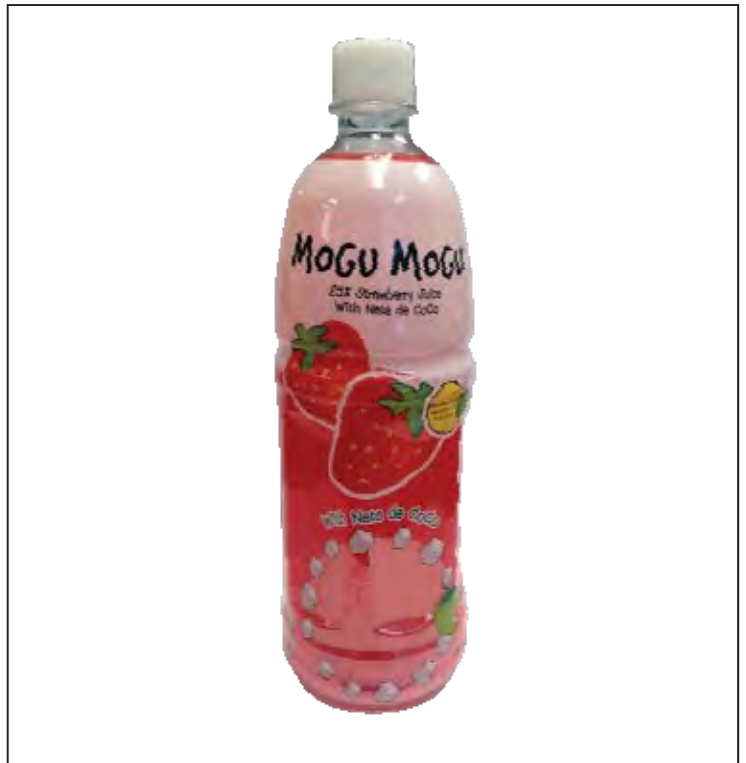
21173 MOGU STRAWBERRY JUICE