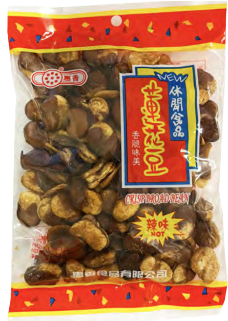
19027 CRISP BROAD BEAN (HOT)