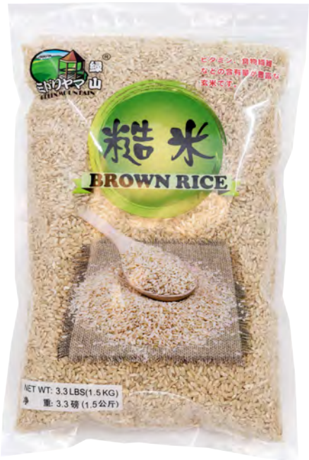
18144 GRN MTN BROWN RICE