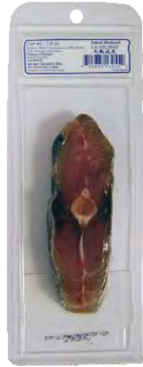
13055 SALTED MACKEREL FISH