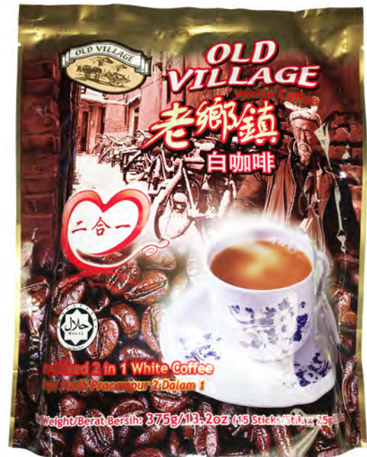
21164 12X15X25GR. OLD VILLAGE 2 IN 1 WHITE COFFEE