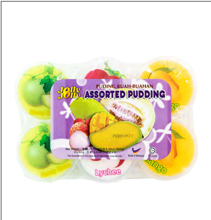
12110 12X6X100GR. ASSORTED FRUIT PUDDING