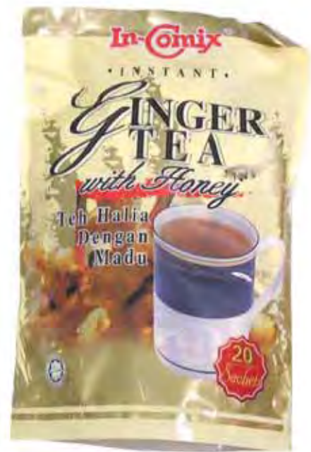
21062 20X18X18GR. INSTANT GINGER TEA (BAG)