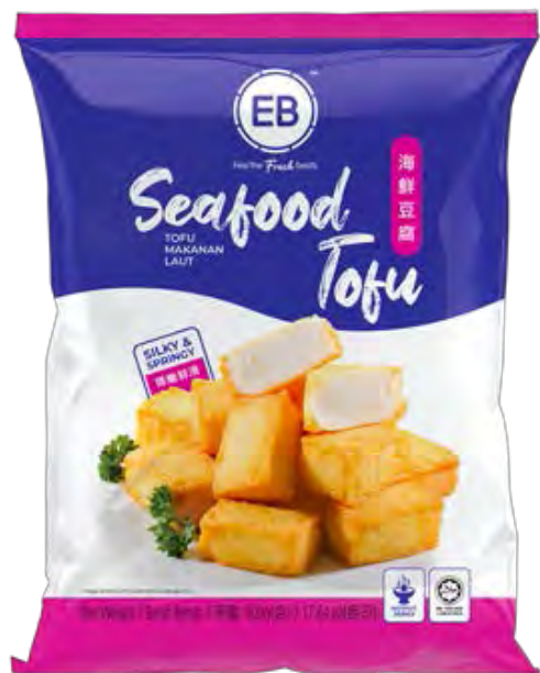
17046 SEAFOOD TOFU