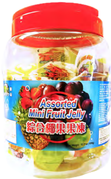
12837 6X1000G. GREEN MOUNTAIN ASSORTED JELLY