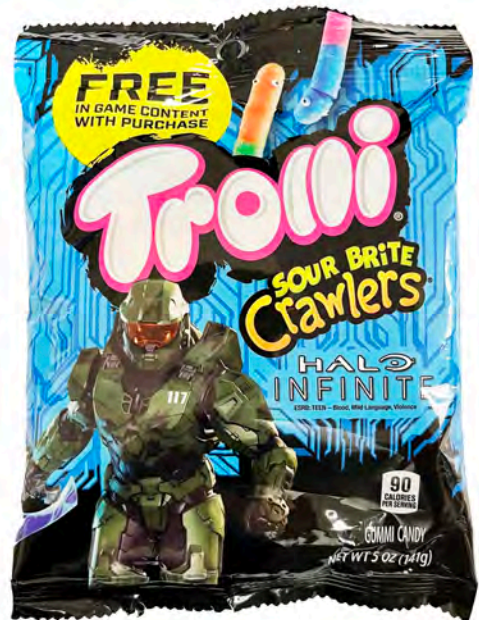
11250 12X5OZ. TROLLI CRAWLERS