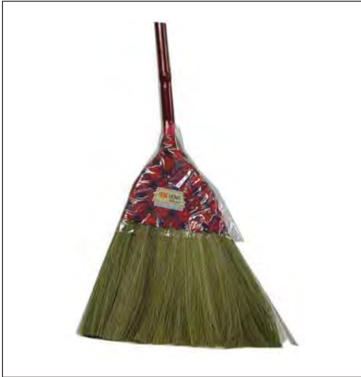
25002 THAI BROOM 1X25PCS.