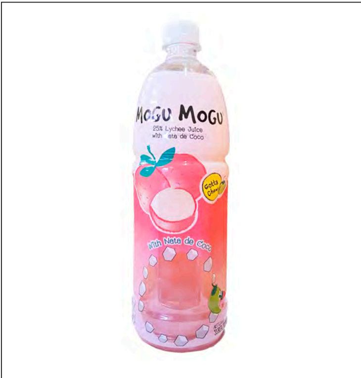
21172 MOGU LYCHEE JUICE