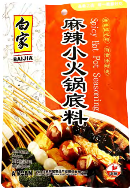
16026 30X200G. SICHUAN HOTPOT SOUP BASE