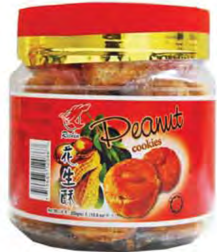
12086 24X10OZ. RICHIN PEANUT COOKIES