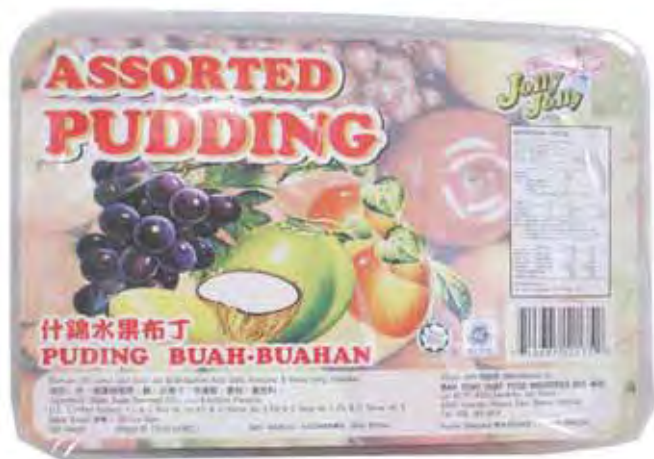
12135 ASSORTED FRUIT PUDDING