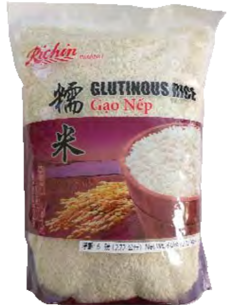
18141 RICHIN GLUTINOUS RICE