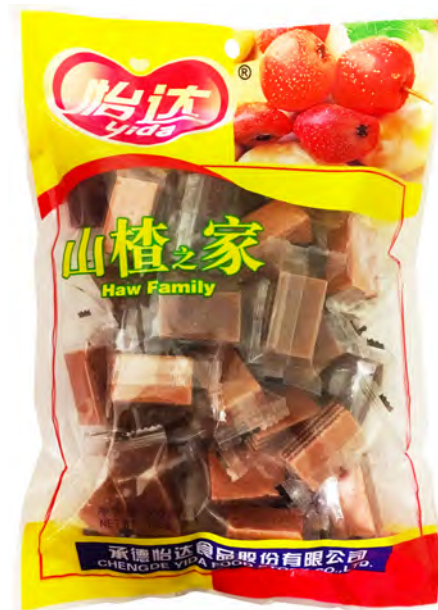
11178 HAW FAMILY