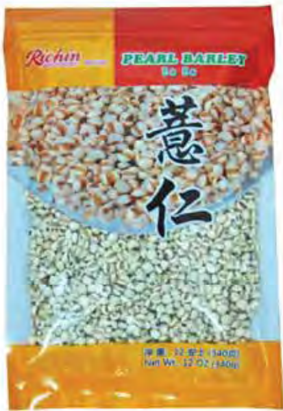
17097 RICHIN PEARL BARLEY