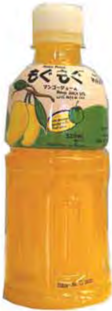
21141 MOGU MANGO JUICE