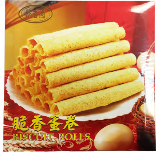
12124 BISCUIT EGGROLL