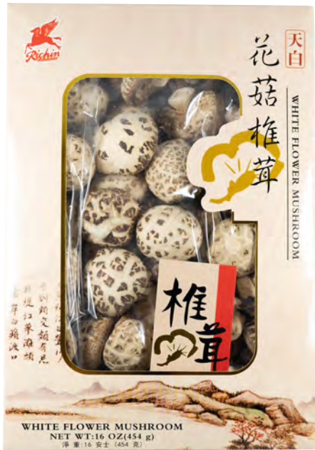
17013 20X16OZ. RICHIN FLOWER MUSHROOM