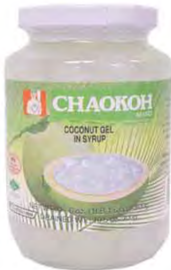
10077 CHAOKOH COCONUT GEL