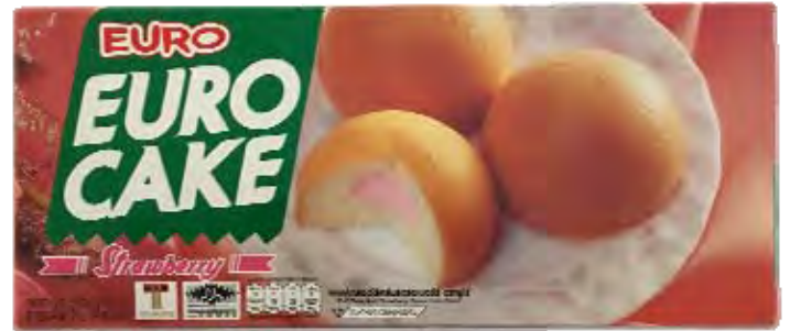
12371 EURO STRAWBERRY CAKE