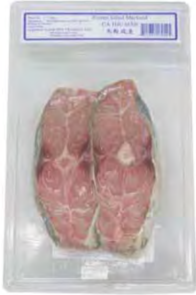
13054 SALTED MACKEREL FISH