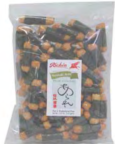
12006 40X3.5OZ. RICE CRACKER W/SEAWEED