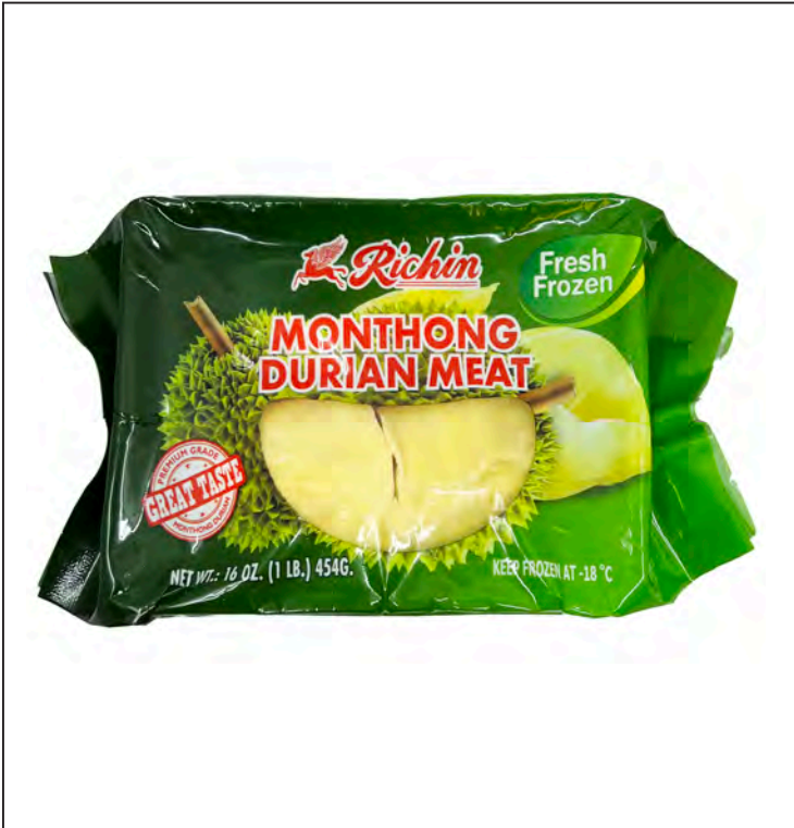
10056 FROZEN DURIAN MEAT (WITH SEED)