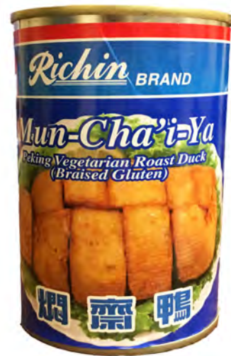
10111 24X10OZ. MUN CHAI YA (BRAISED GLUTEN)