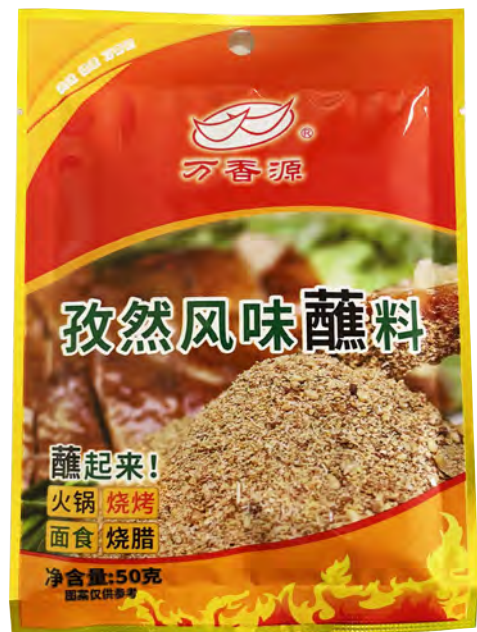
15104 CUMIN FLAVOR DIP POWDER