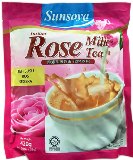
21167 24X12X35GR.. INSTANT ROSE MILK TEA