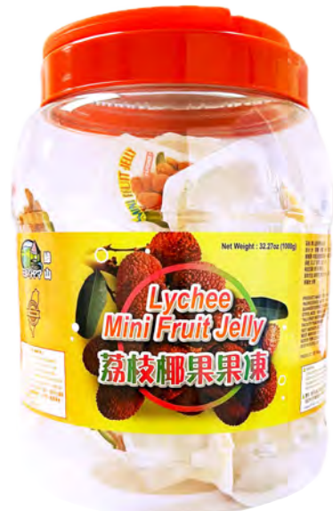
12838 6X1000G. GREEN MOUNTAIN LYCHEE JELLY