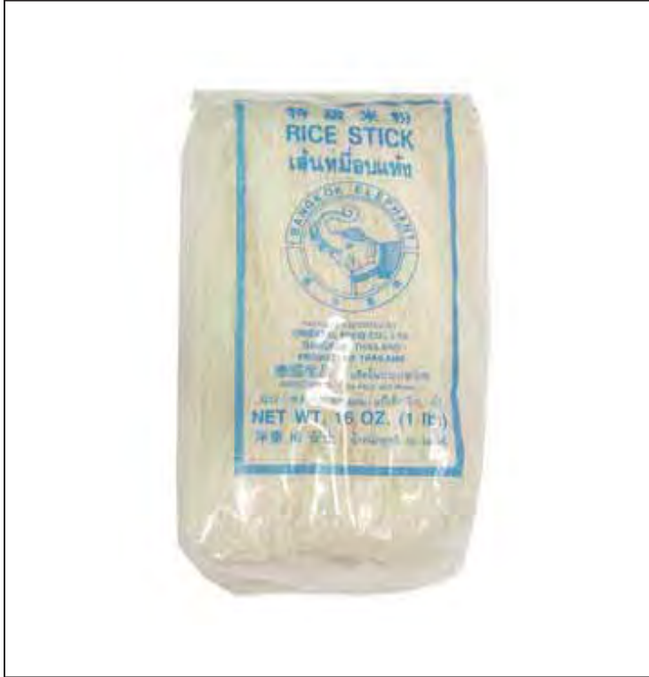
18023 24X16OZ. B.K. ELEPHANT RICE STICK