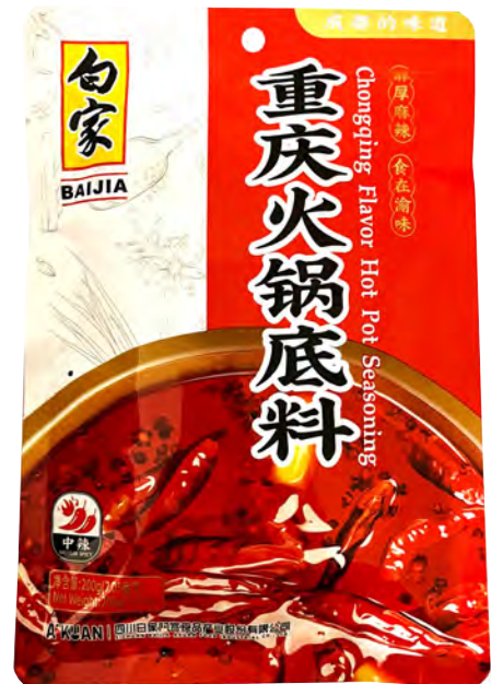
16028 30X200G. CHONGQING HOTPOT SOUP BASE