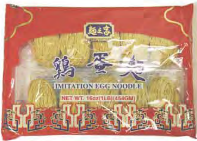
18121 20X16OZ. IMITATION EGG NOODLE(S)