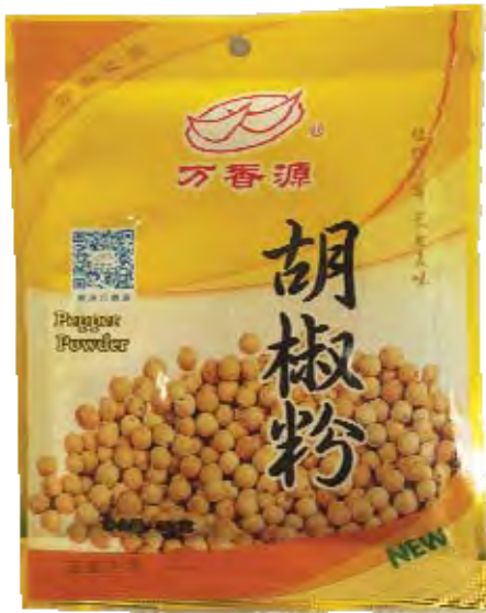
15091 PEPPER POWDER