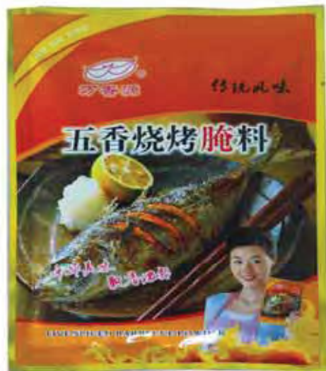
15124 8X25X50GR. FIVE SPICED BARBECUE POWDER