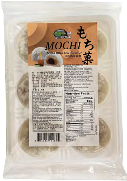
12189 GM MOCHI (BOBA TEA)