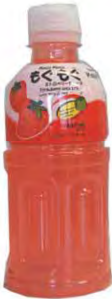
21143 MOGU STRAWBERRY JUICE