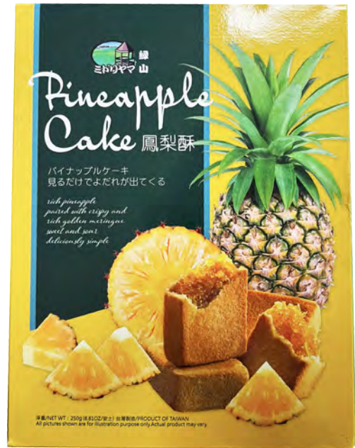
12181 PINEAPPLE CAKE GIFT BOX