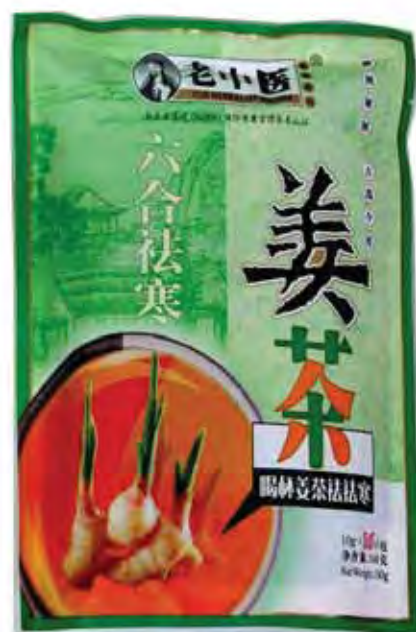
21068 20X16X10GR. GINGER TEA