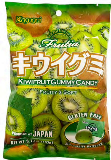
11123 24X3.97OZ. KASUGAI KIWI GUMMY