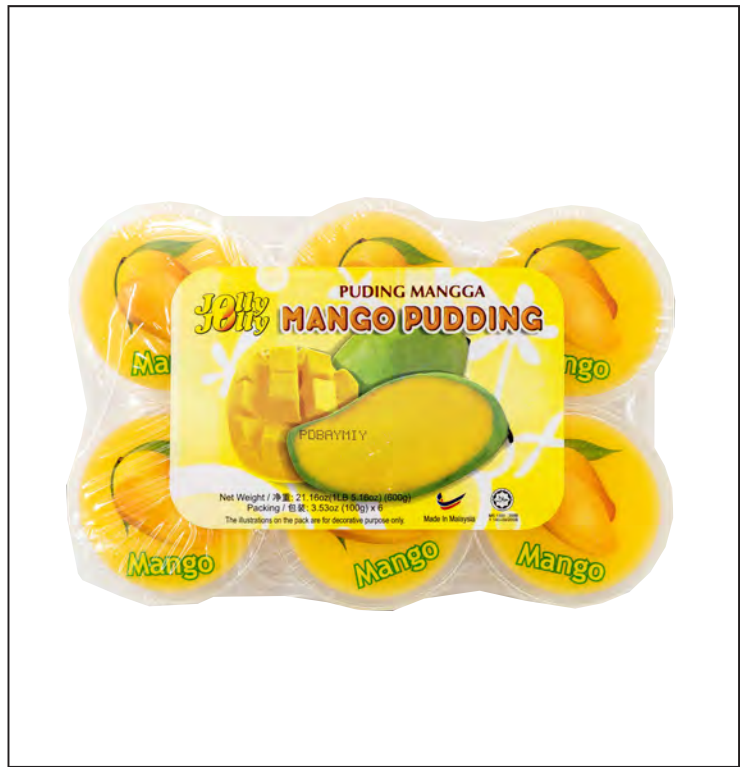
12109 12X6X100GR. MANGO PUDDING