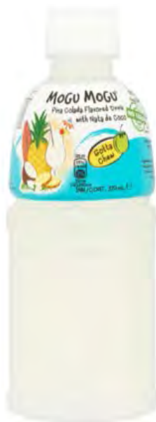
21159 MOGU PINA COLADA