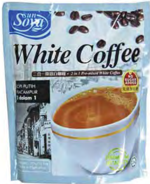
21160 24X15X25GR. WHITE COFFEE (SUGAR FREE)