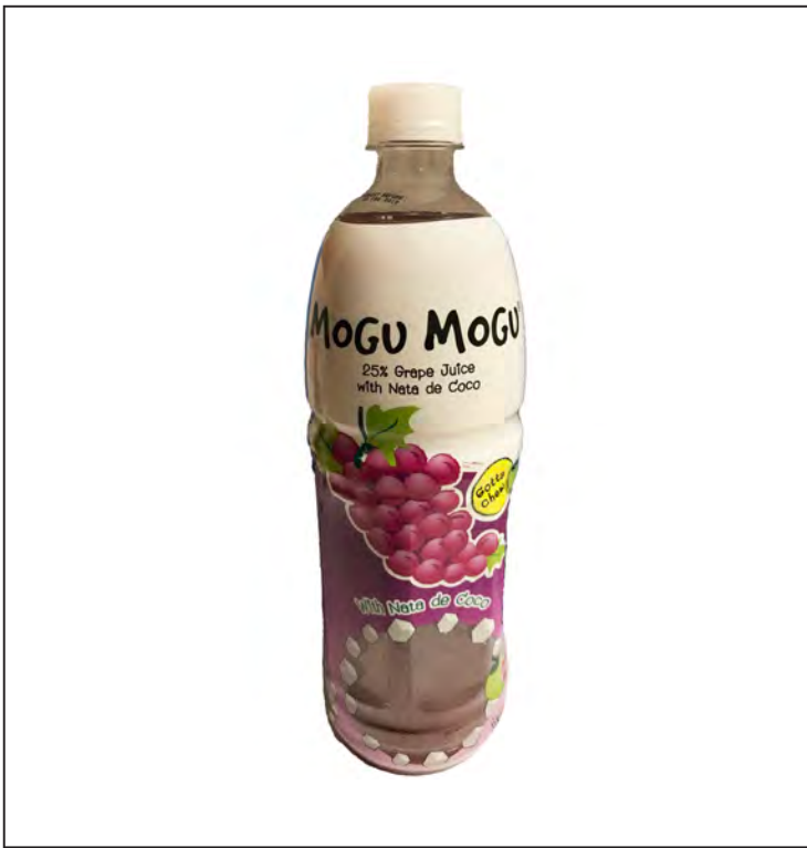
21170 MOGU GRAPE JUICE