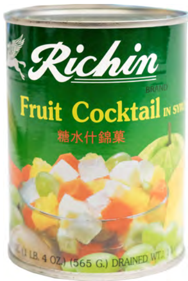
10062 RICHIN FRUIT COCKTAIL