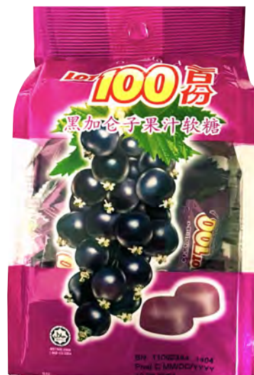
11190 LOT 100 BLACKCURRANT GUMMY