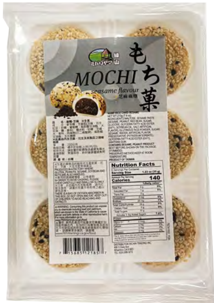
12185 GM MOCHI (SESAME)