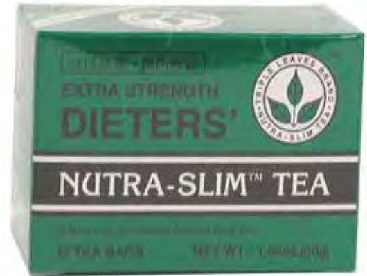
90002 NUTRA-SLIM TEA