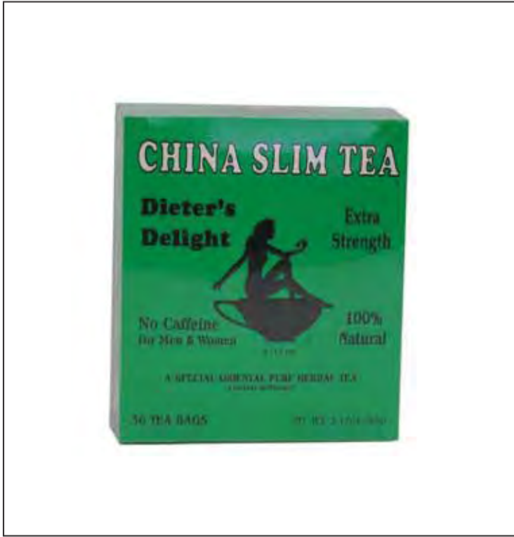
90005 24X36 TEA BAGS CHINA SLIM TEA