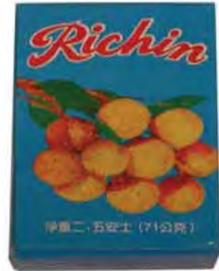
17104 THAILAND DRIED LONGAN