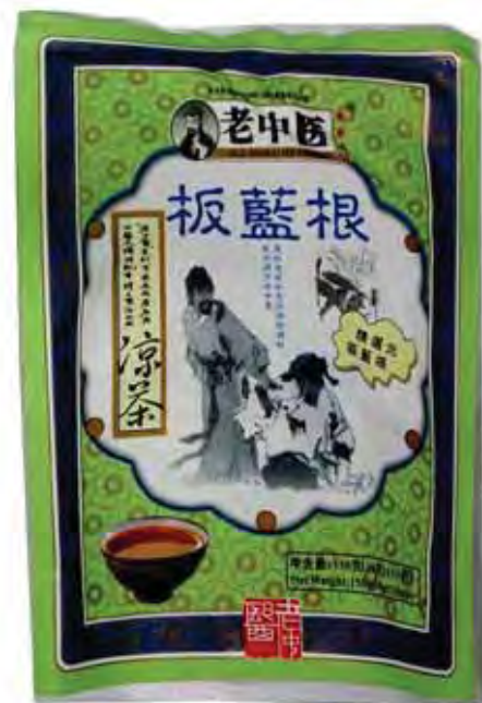
21066 20X15X10GR. RADIX IS TIDIS TEA