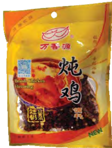
15102 BRAISED CHICKEN FLAVORING