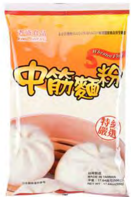
18013 WHEATER FLOUR