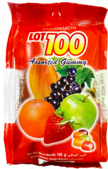
11188 LOT 100 MIXED GUMMY