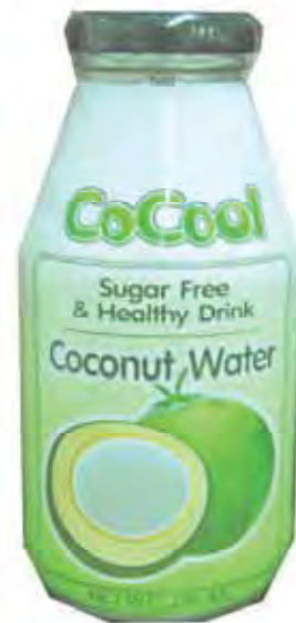
21134 COCOOL COCONUT WATER