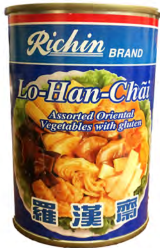
10110 24X10OZ. LOH HAN CHAI VEGETABLES ASSORTED