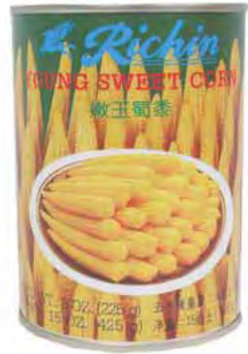
10015 24X15OZ. RICHIN BABY CORN