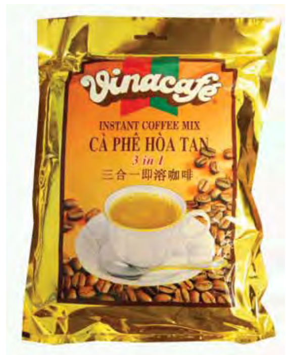
21056 20X20X20G VINA CAFÉ 3 IN 1