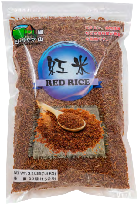
18149 RICHIN RED RICE