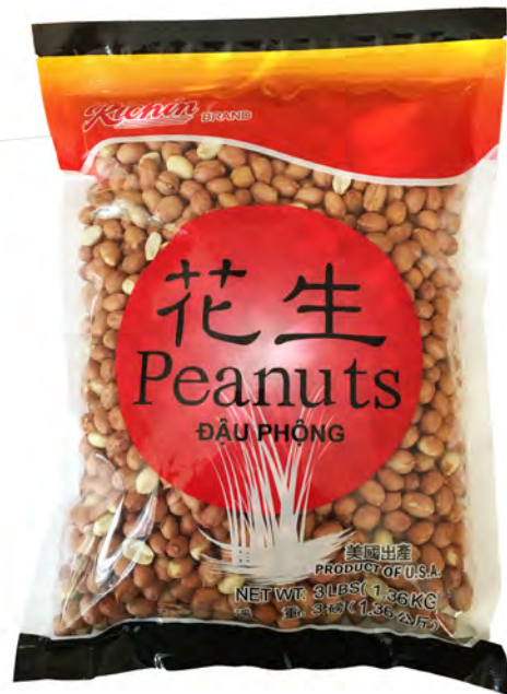
17134 3LBSX10BAGS RICHIN PEANUT WITH SKIN