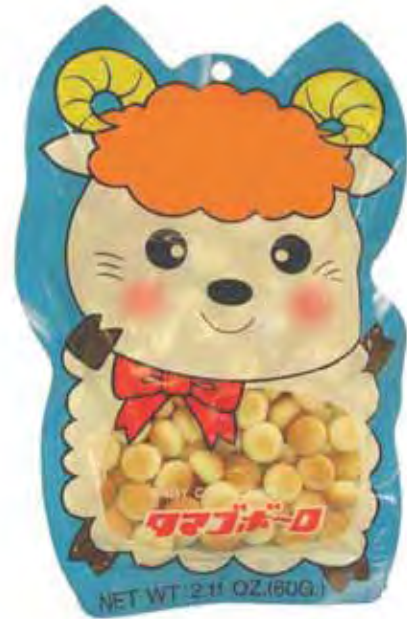
12003 20X2.11OZ. SANTA BABY COOKIES