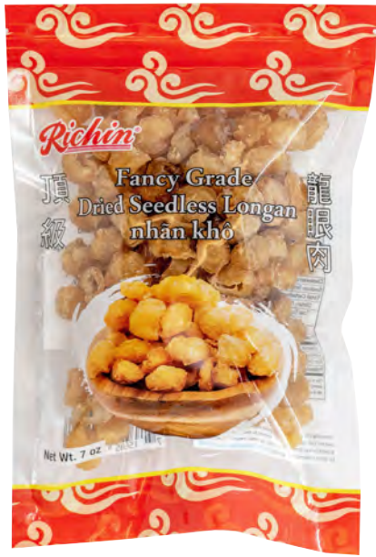
17106 DRIED LOGAN MEAT