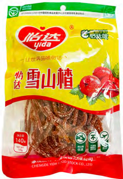
11174 SNOW HAW