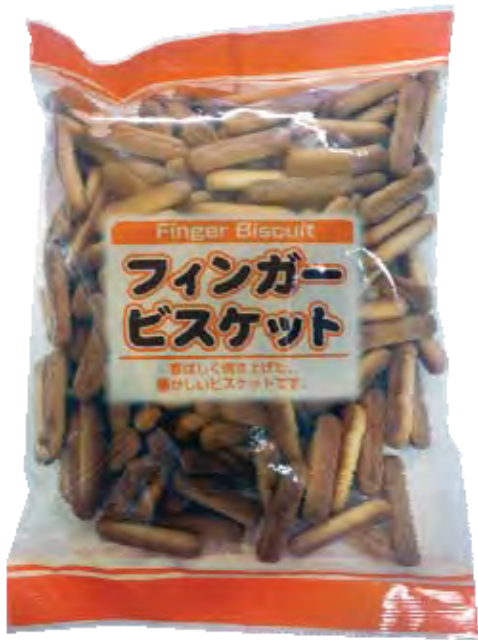
12005 12X6.33 OZ FINGER BISCUIT