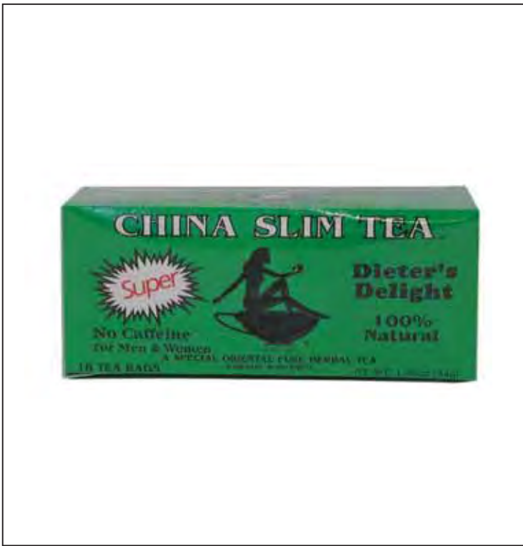
90006 36X18 TEA BAGS CHINA SLIM TEA (SUPER)