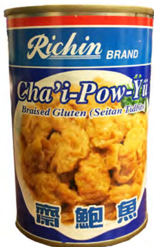
10112 24X10OZ. CHAI ABALONE (BRAISED GLUTEN)