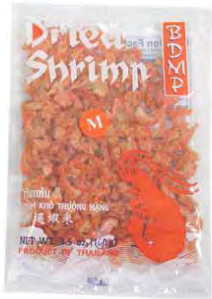
13019 50X3.5OZ. BDMP DRIED SHRIMP (M)