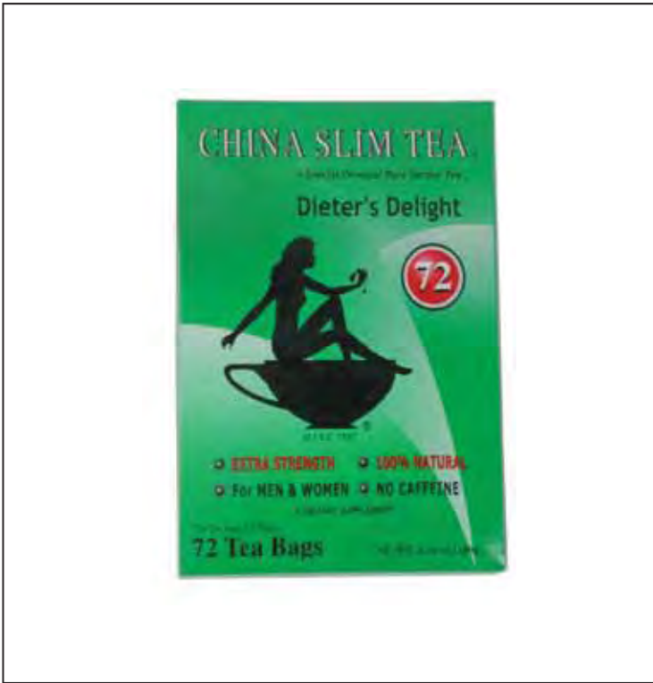
90003 12X72 TEA BAGS CHINA SLIM TEA