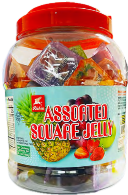
12162 6X1400G. RICHIN ASSORTED SQUARE JELLY