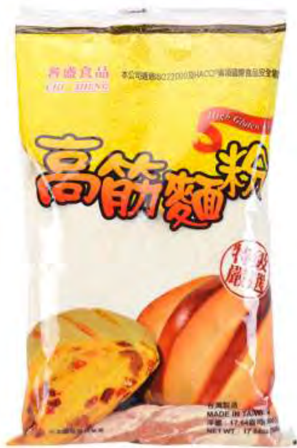
18007 HIGH GLUTEN FLOUR