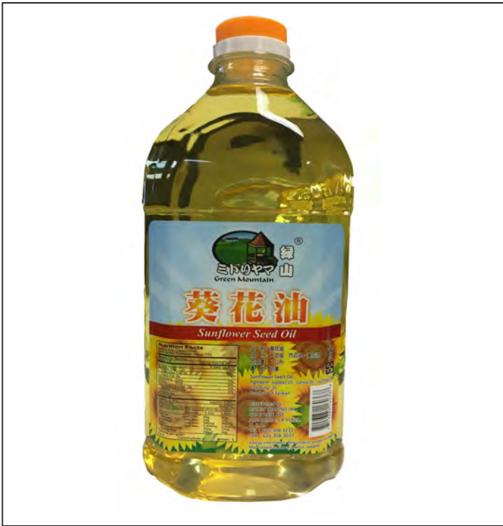
16036 6X2 L GREEN MOUNTAIN SUNFLOWER SEED OIL