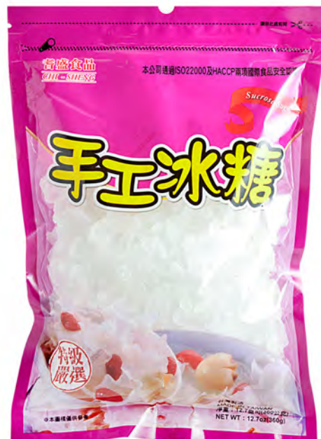
18037 SUCROSE SUGAR