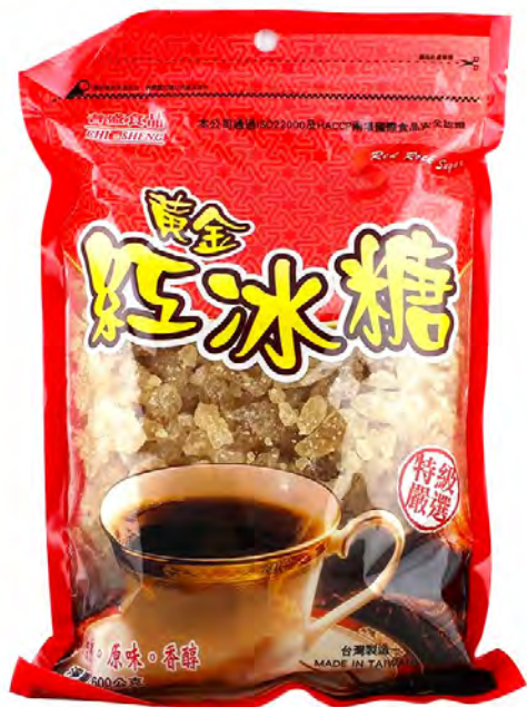
18038 RED ROCK SUGAR