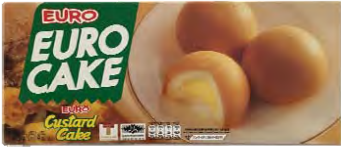
12370 EURO CUSTARD CAKE