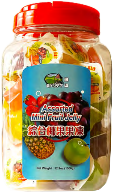
12835 6X1500G. GREEN MOUNTAIN ASSORTED JELLY