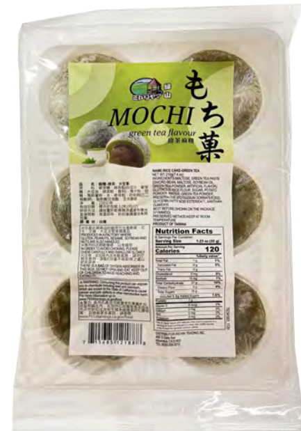
12188 GM MOCHI (GREEN TEA)