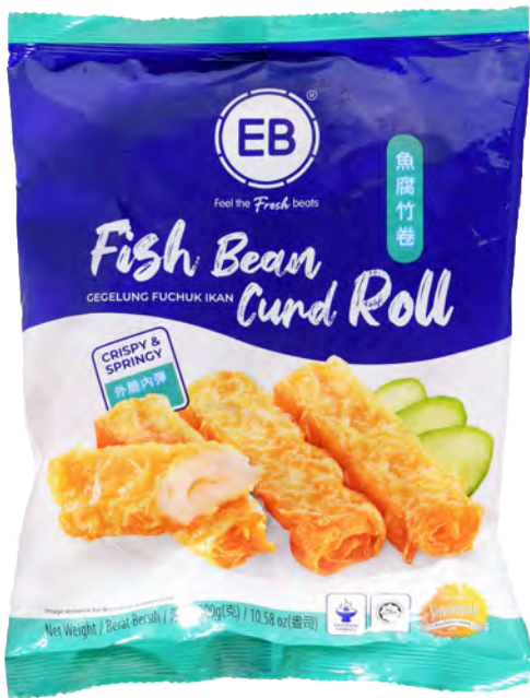
17033 FISH BEANCURD ROLL