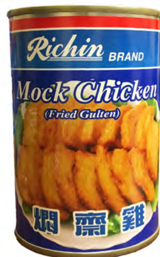
10113 24X10OZ. MOCK CHICKEN (FRIED GLUTEN)