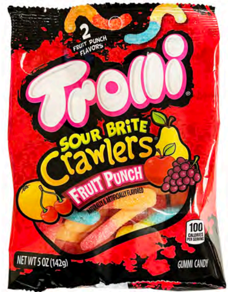
11259 TROLLI FRUIT PUNCH CRAWLERS