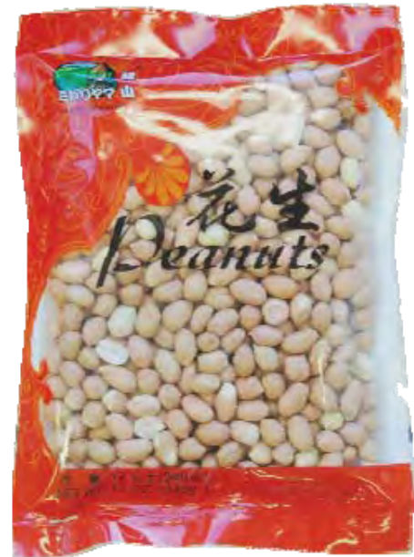
17138 50X12OZ. RICHIN PEANUT W/SKIN