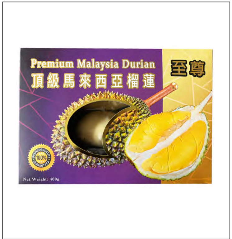
10048 FROZEN DURIAN PULP