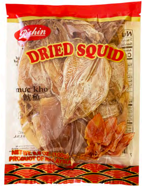
13058 50X3.5OZ. RICHIN DRIED SQUID (SKINLESS)