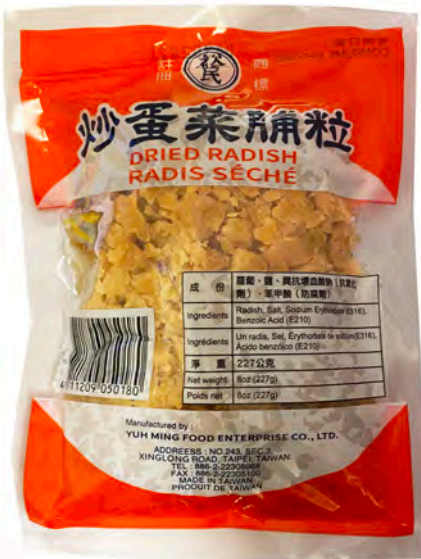
17059 YUH MING DRIED RADISH