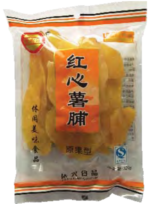
17103 24X320GR. DRIED SWEET POTATO SLICES