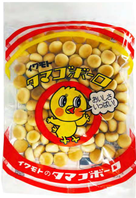
12007 30X2.05OZ. HONEY BALL COOKIES