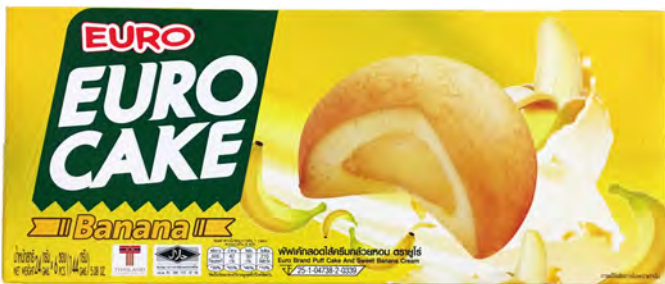
12372 EURO BANANA CAKE