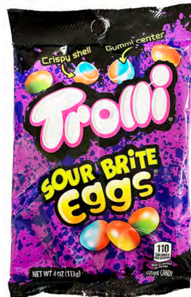
11264 TROLLI SOUR BRITE EGGS