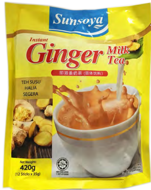
21165 24X12X35GR.. INSTANT GINGER MILK TEA