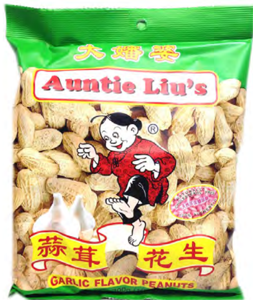
11214 30X300GR. AUNTIE LIU'S GARLIC PEANUT