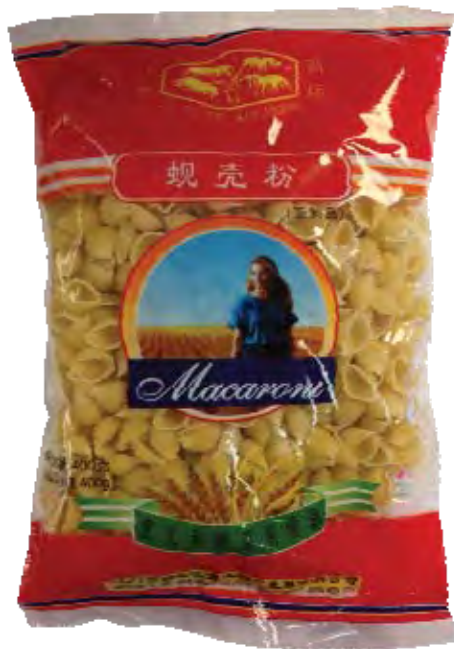
18103 MACARONI (SHELL)