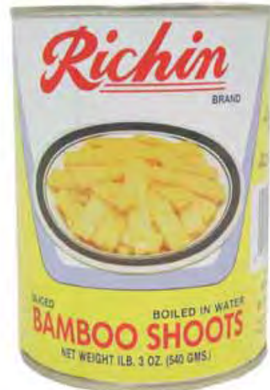
10028 24X19OZ. RICHIN BAMBOO SHOOT (SLICE)