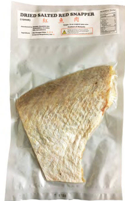
13028 DRIED RED SNAPPER