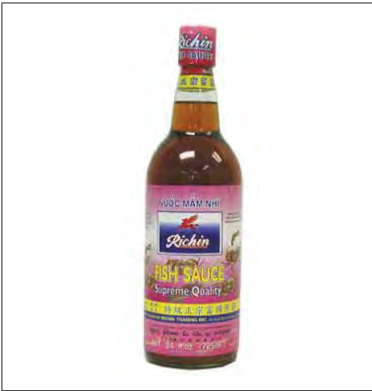
16021 12X24OZ. RICHIN FISH SAUCE