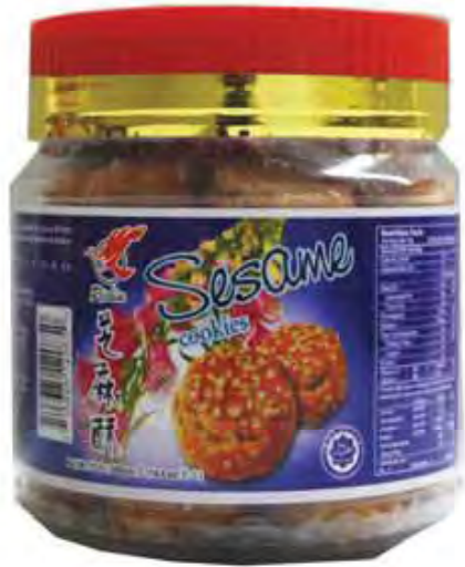
12085 24X10OZ. RICHIN SESAME COOKIES