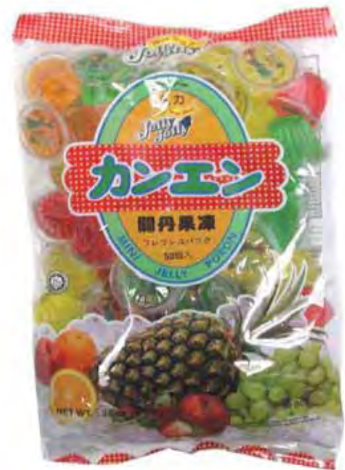
12142 JOLLY JELLY IN CUP