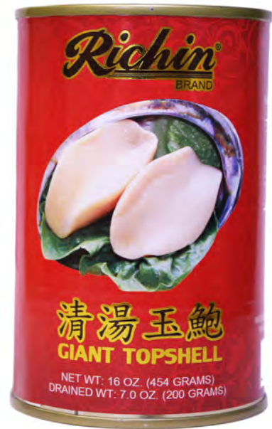
10132 24X16OZ (4PCS) RICHIN GIANT TOPSHELL