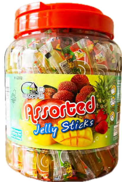
12154 6X1400G. GM JELLY STRAWS