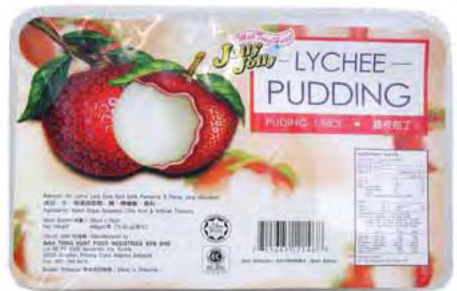
12244 LYCHEE PUDDING