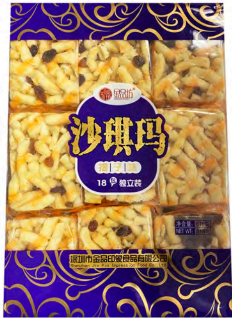
12201 12X518G. SOFT FLOUR CAKE (RAISIN)