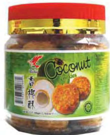
12088 24X10OZ. RICHIN COCONUT COOKIES