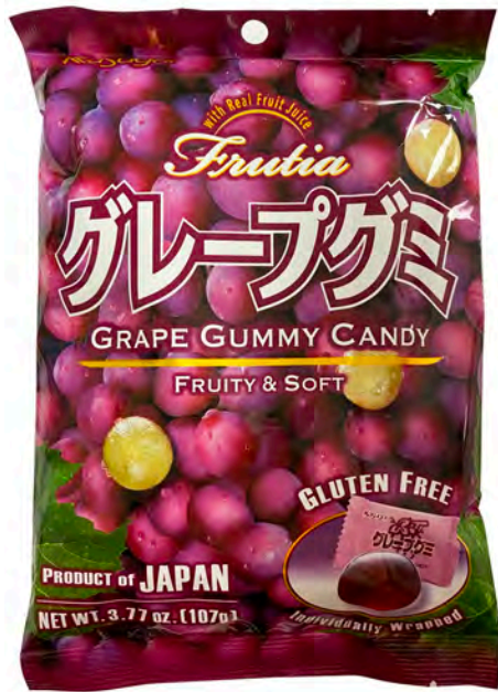
11119 24X3.97OZ. KASUGAI GRAPE GUMMY