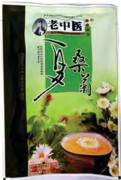
21067 20X15X10GR. CHRYSANTHEMUM TEA