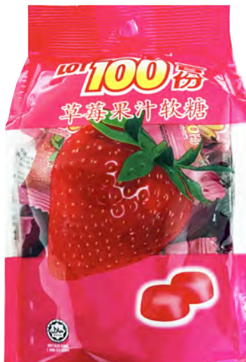
11189 LOT 100 STRAWBERRY GUMMY