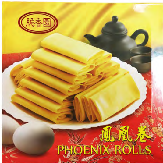
12114 PHOENIX EGGROLL