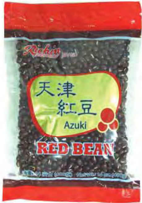
20001 50X14OZ. RICHIN TIAN JIN RED BEANS