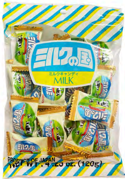
11041 24X4.23OZ. KASUGAI MILK CANDY