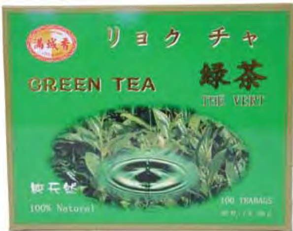
21033 24X100 TEA BAGS AROMA GREEN TEA (BAG)