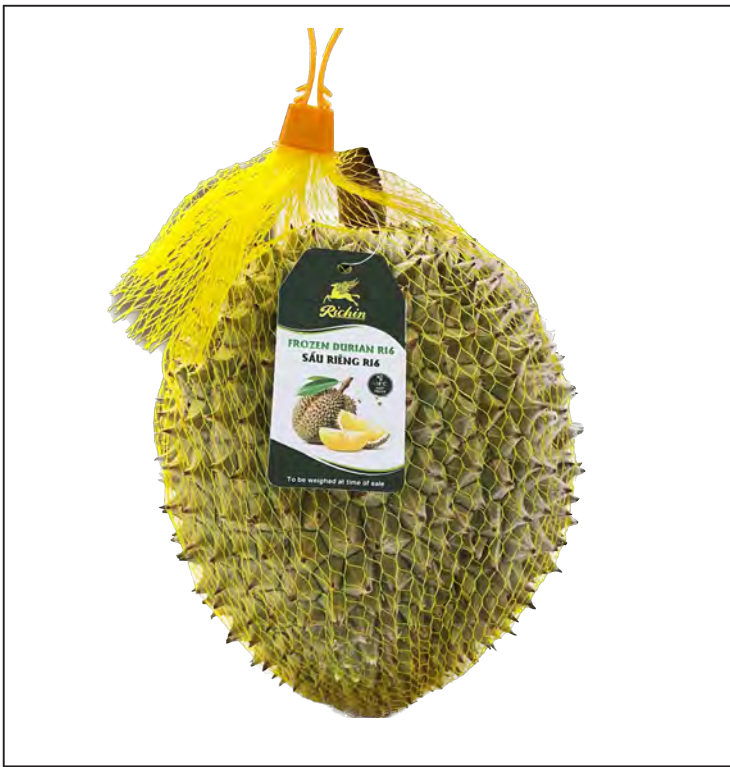
10142 VIETNAM RI6 DURIAN