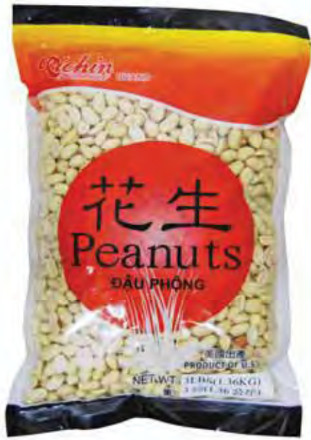
17131 3LBSX10BAGS RICHIN PEANUT WITHOUT SKIN