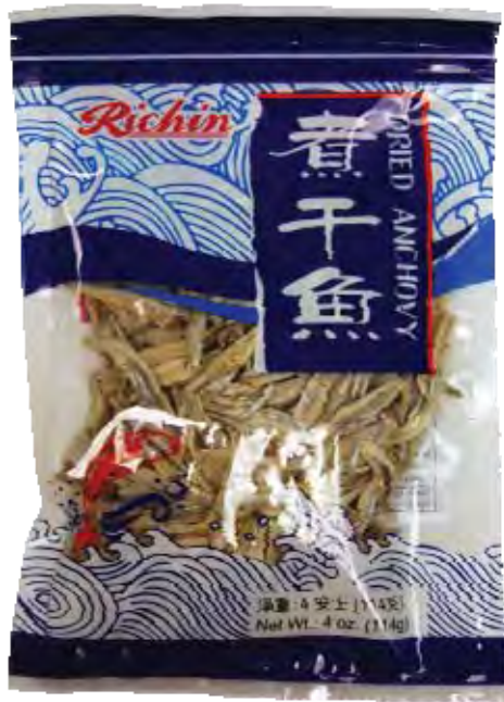
13015 50X4OZ. DRIED ANCHOVY (HEADLESS)