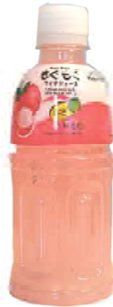
21142 MOGU LYCHEE JUICE