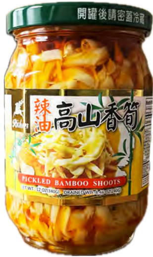
17121 2X12X12OZ. BAMBOO SHOOT IN CHILI OIL