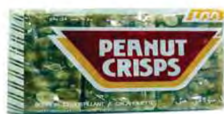
11187 PRB PEANUT CRISPS