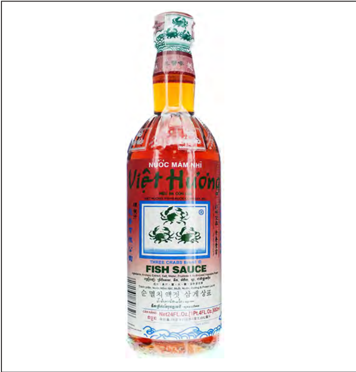
16020 12X24OZ. THREE CRAB FISH SAUCE