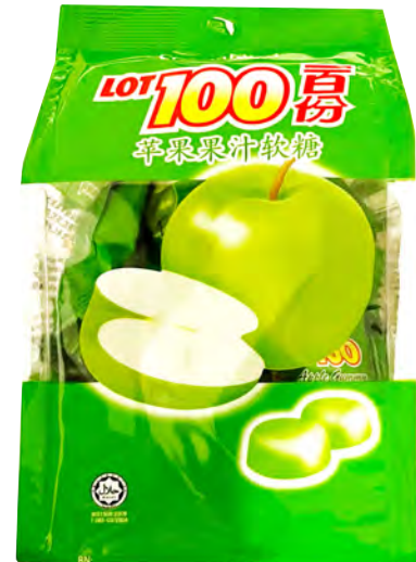
11193 LOT 100 APPLE GUMMY