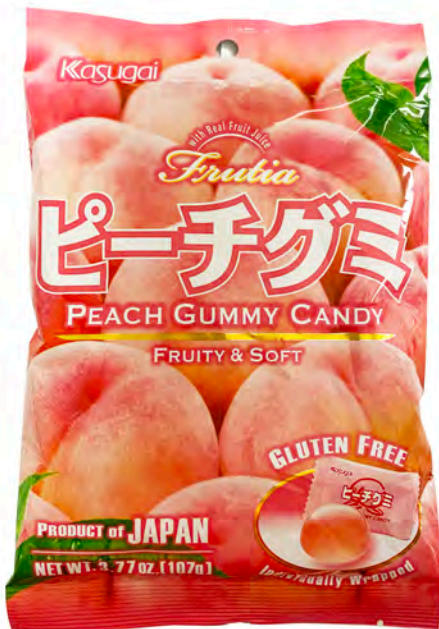
11121 24X3.97OZ. KASUGAI PEACH GUMMY