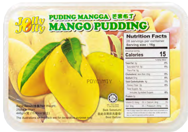
12137 MANGO PUDDING