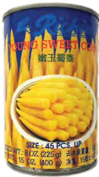
10014 24X15OZ. RICHIN BABY CORN IN BRINE (45 PCS UP)