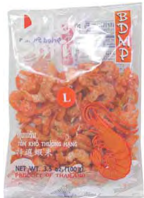
13020 50X3.5OZ. BDMP DRIED SHRIMP (L)