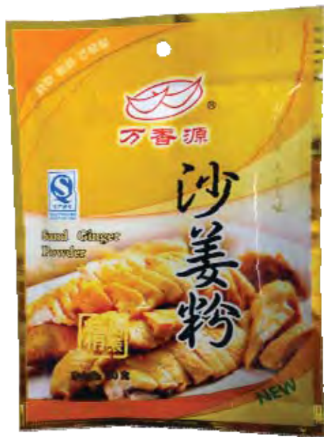
15101 GINGER POWDER