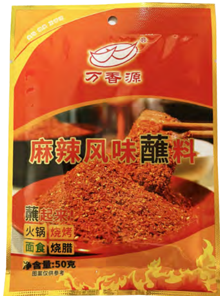
15103 SPICY FLAVOR DIP POWDER