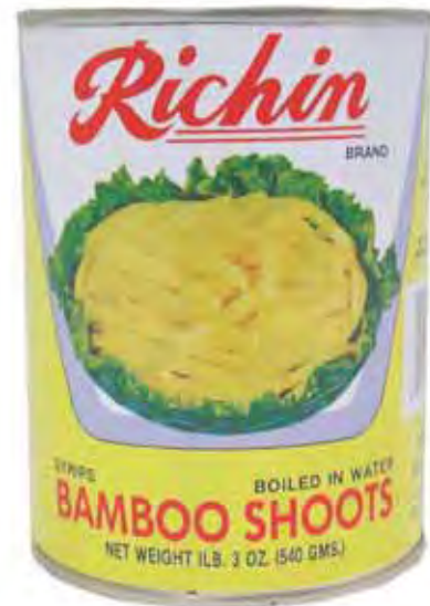
10026 24X19OZ. RICHIN BAMBOO SHOOT (STRIP)