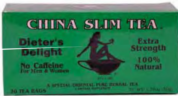
90000 CHINA SLIM TEA