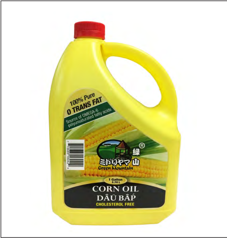
16042 4X1.0GAL. GREEN MOUNTAIN CORN OIL