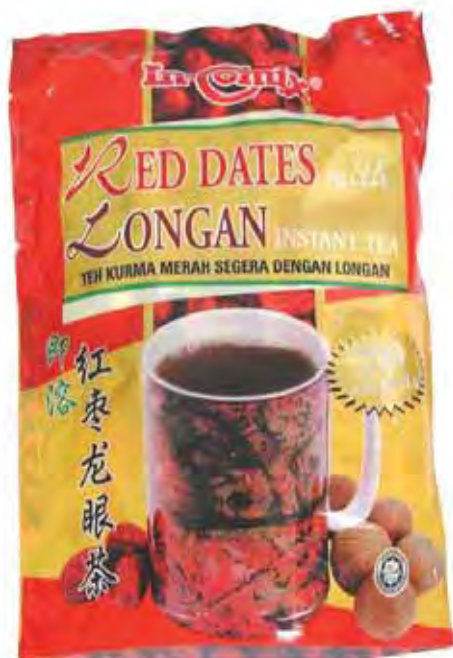
21064 20X18X18GR. INSTANT RED DATES TEA (BAG)