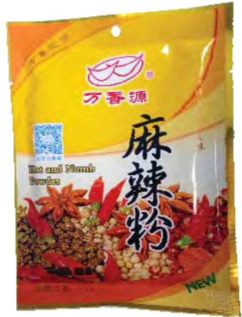
15090 HOT & NUMB POWDER