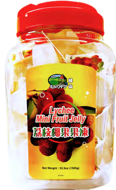
12836 6X1500G. GREEN MOUNTAIN LYCHEE JELLY