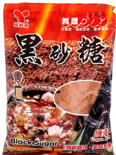
18040 BLACK SUGAR