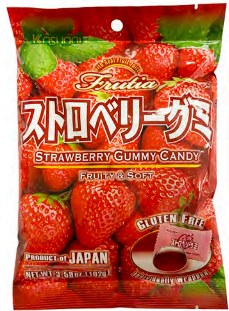
11120 24X3.97OZ. KASUGAI STRAW. GUMMY