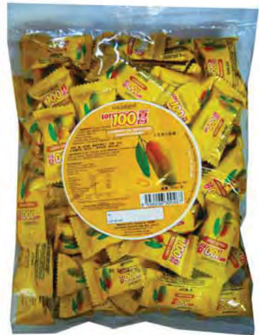
11220 LOT 100 MANGO GUMMY