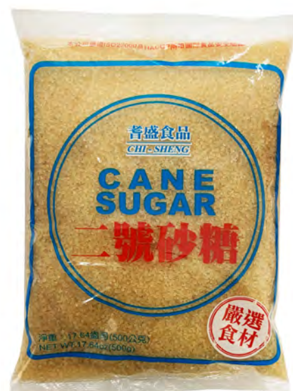
18035 CANE SUGAR