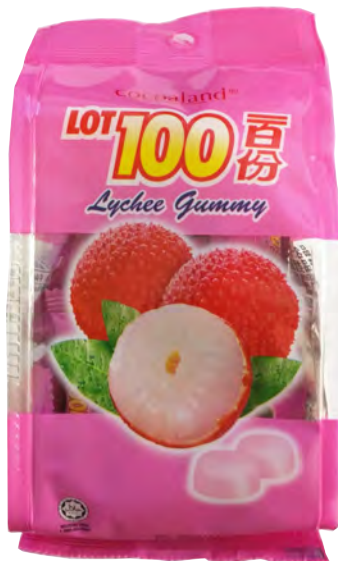
11195 LOT 100 LYCHEE GUMMY