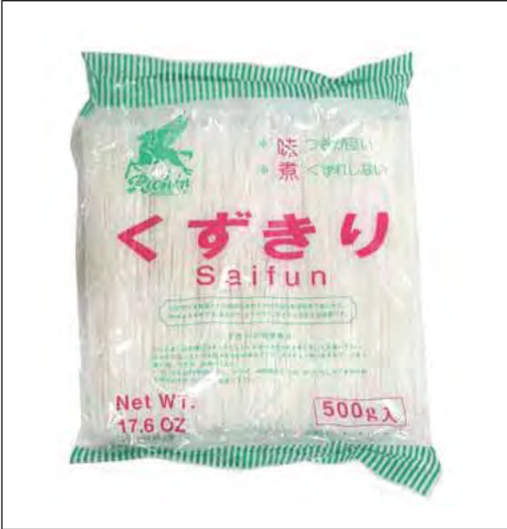
18053 20X500G RICHIN JAPANESE SAIFUN