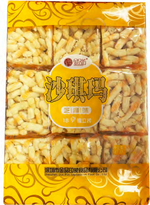
12202 12X518G. SOFT FLOUR CAKE (SESAME)