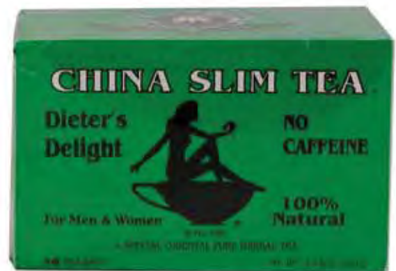
90004 CHINA SLIM TEA