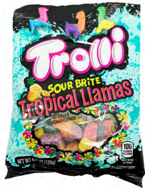
11268 TROLLI SOUR BRITE LLAMAS