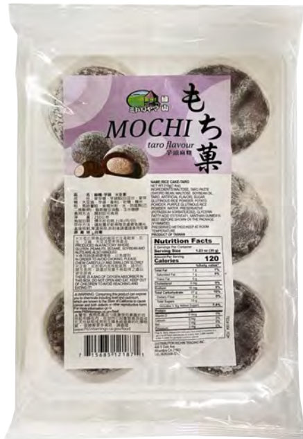
12187 GM MOCHI (TARO)