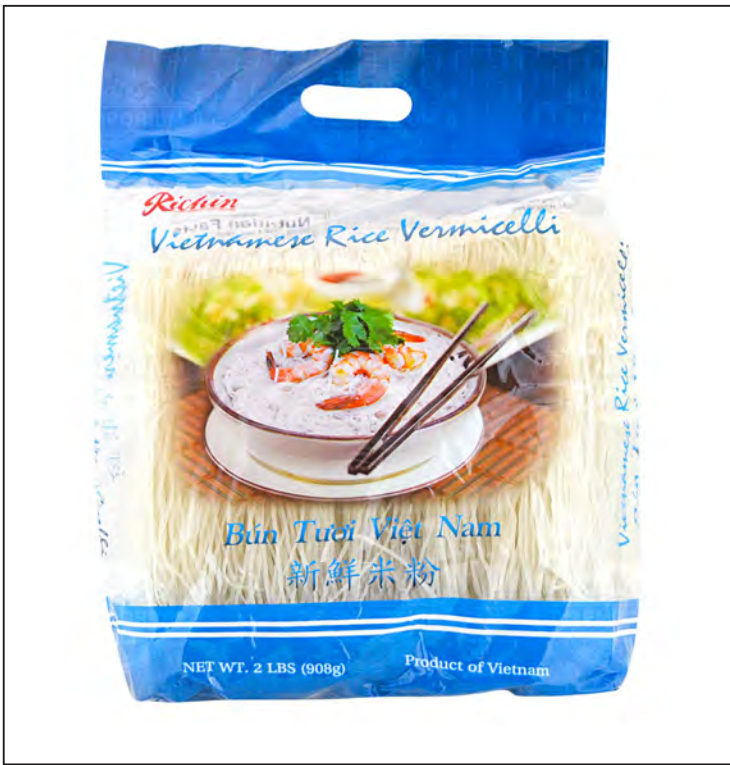
18280 15X2LBS. RICHIN VIETNAMESE RICE VERMICELLI