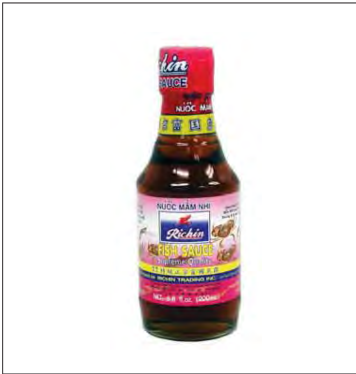
16023 24X200ML. RICHIN FISH SAUCE (S)