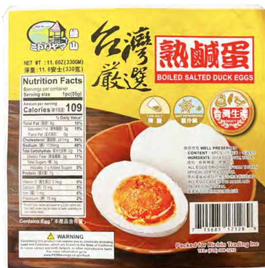
17128 GM SALTED DUCK EGG