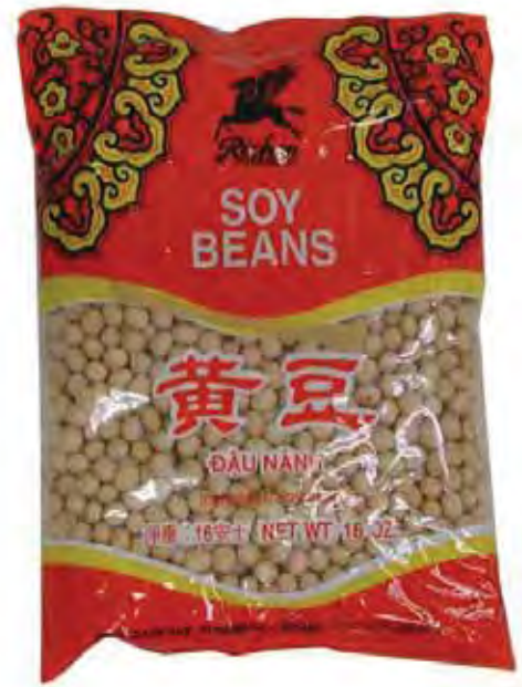
20010 50X16OZ. RICHIN SOY BEANS