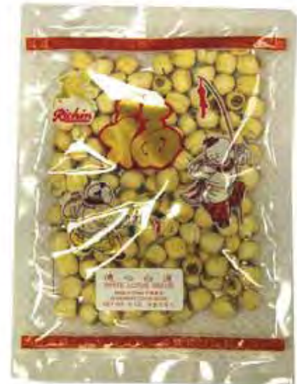
17081 RICHIN DRIED LOTUS SEEDS