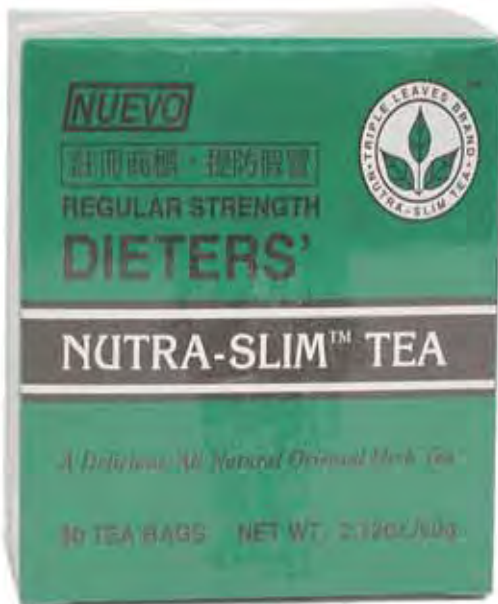
90001 NUTTR SLIM TEA