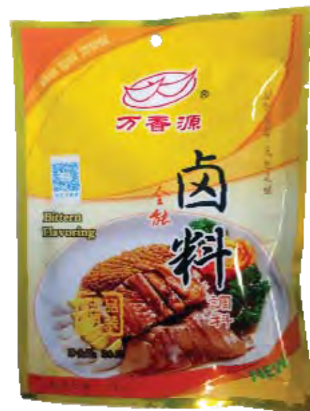
15122 8X20X30GR. BITTERN SEASONING