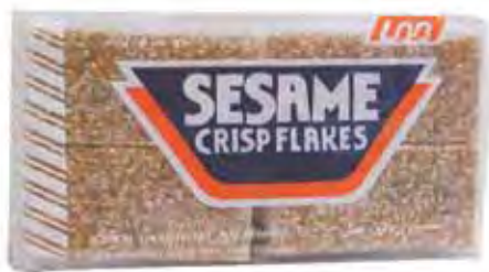
11186 PRB SESAME CRISPS FLAKE