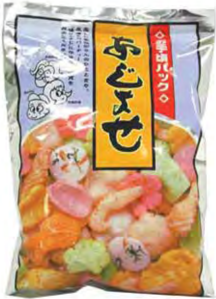
12160 20X2.81OZ. WAKABATO AJINO CRACKER