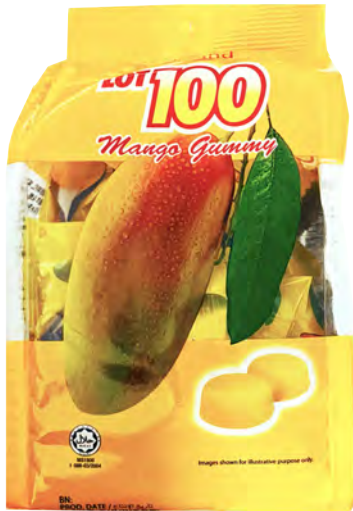
11185 LOT 100 MANGO GUMMY