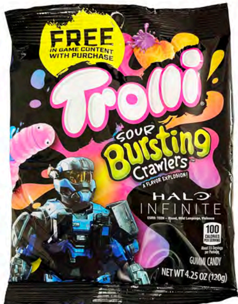
11253 TROLLI BURSTING CRAWLERS