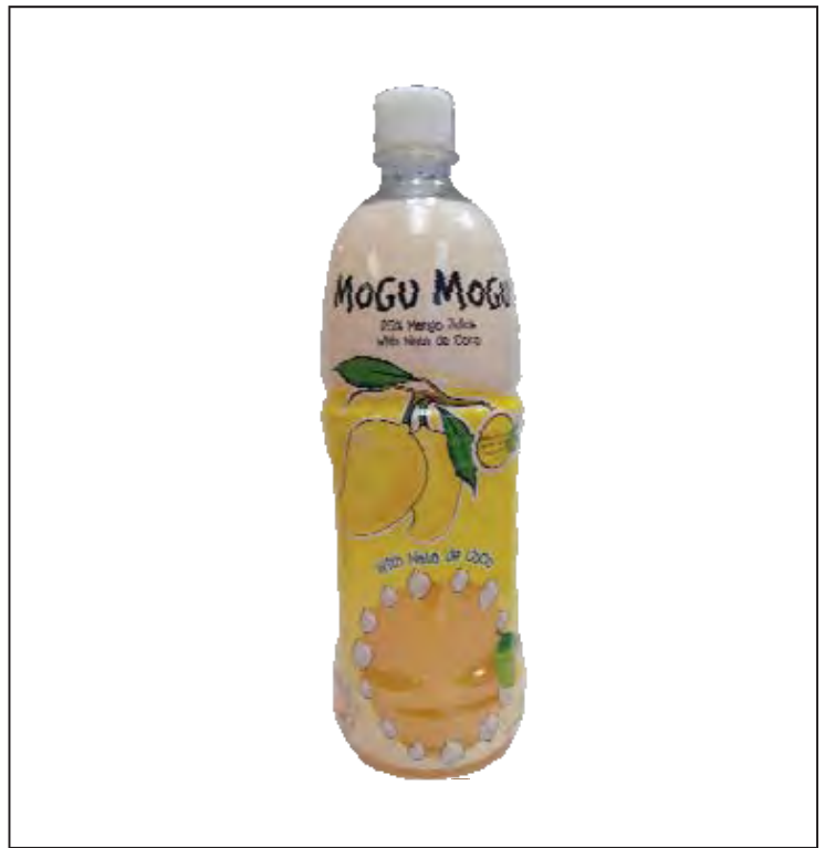
21171 MOGU MANGO JUICE