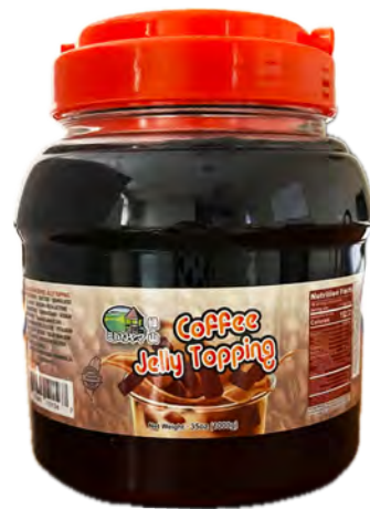
12156 12X1000G. JELLY TOPPING COFFEE