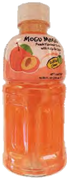
21155 MOGU PEACH JUICE