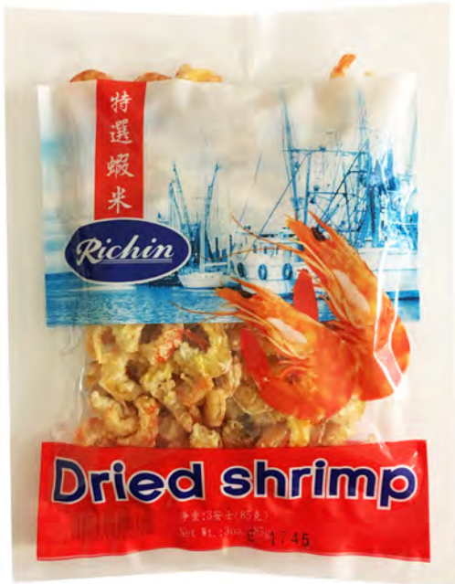
13014 DRIED SHRIMP (M)