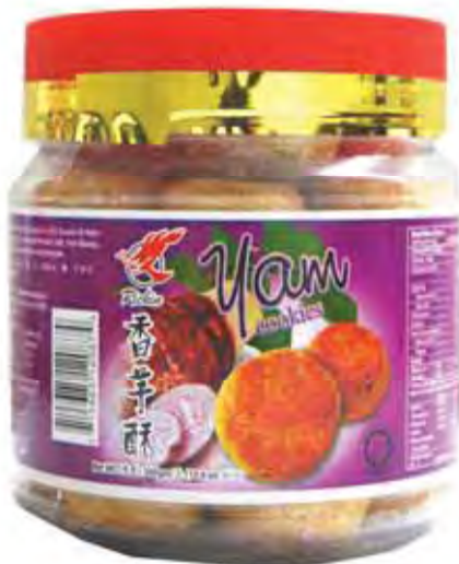
12087 24X10OZ RICHIN YAM COOKIES