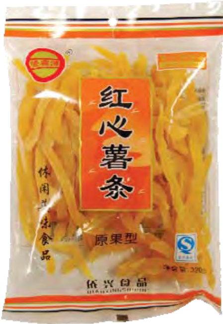
17102 24X12 OZ. RICHIN DRIED SWEET POTATO