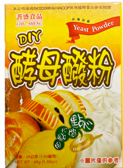
18010 YEAST POWDER