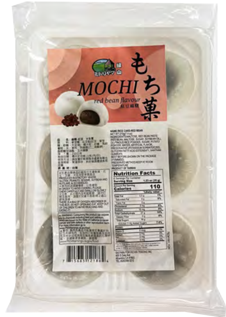
12186 GM MOCHI (RED BEAN)