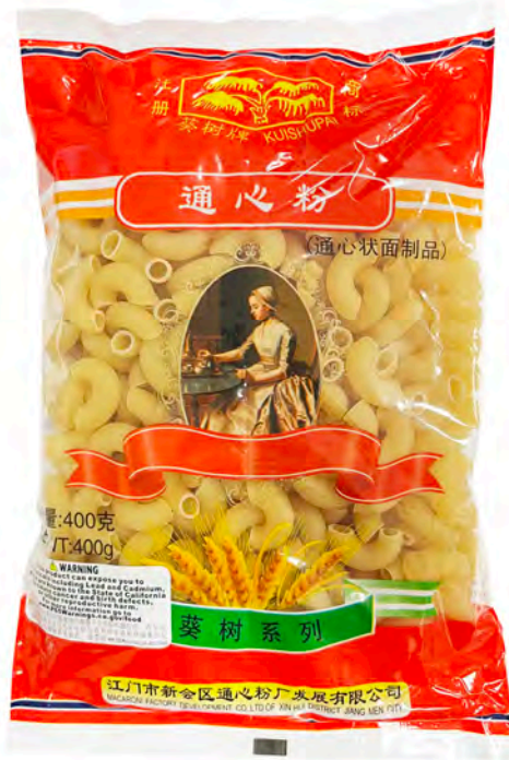
18101 MACARONI (FLOUR)