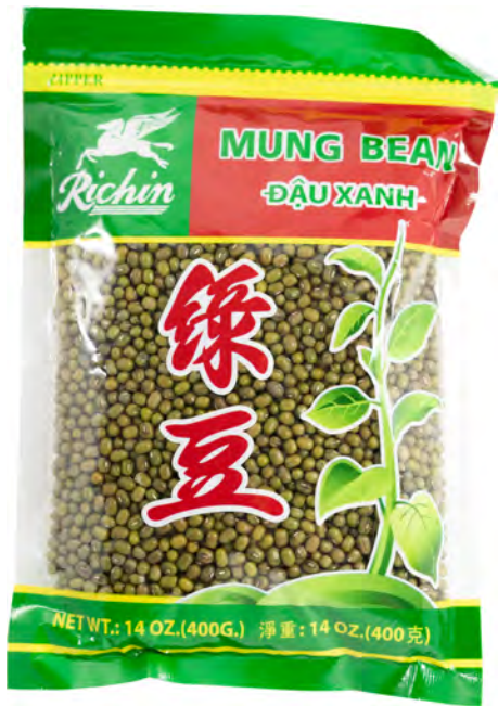
20016 50X14OZ. RICHIN MUNG BEAN