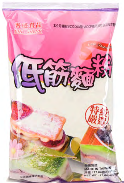
18014 LOW GLUTEN FLOUR