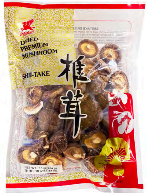
17018 30X10 OZ. RICHIN DRIED PREMIUM MUSHROOM