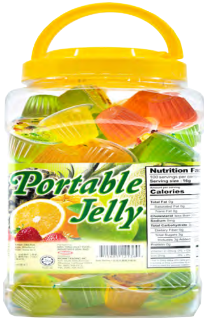
12136 6X100PCS.X16G PORTABLE JELLY CUP