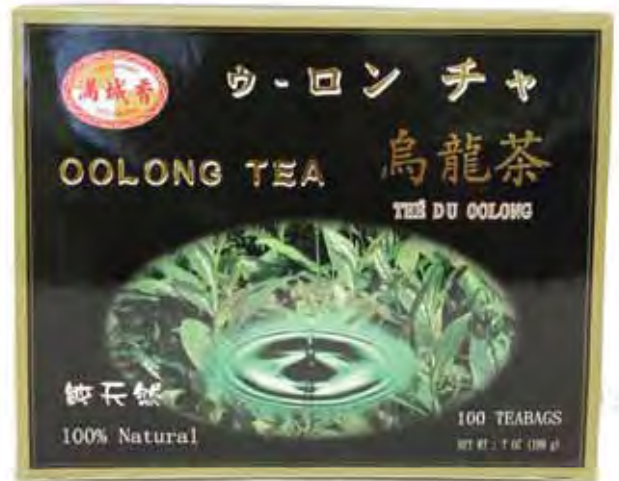
21032 24X100 TEA BAGS AROMA OOLONG TEA (BAG)