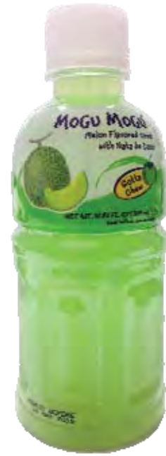
21158 MOGU MELON JUICE