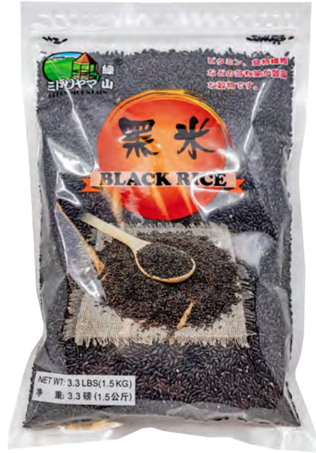
18150 RICHIN BLACK RICE