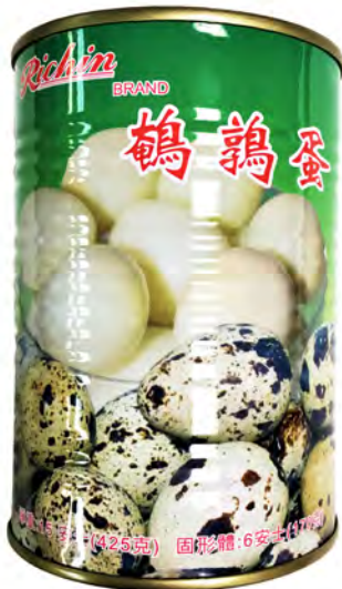
10038 24X15OZ. RICHIN QUAIL EGG (TAIWAN)