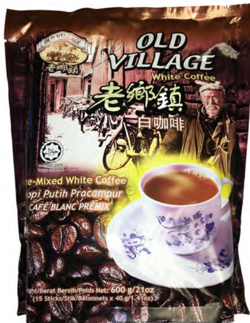
21162 24X15X40GR. OLD VILLAGE WHITE COFFEE