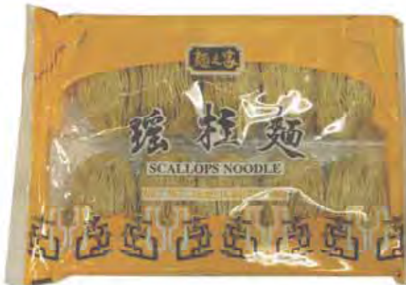
18127 20X16OZ. IMITATION SCALLOPS NOODLE