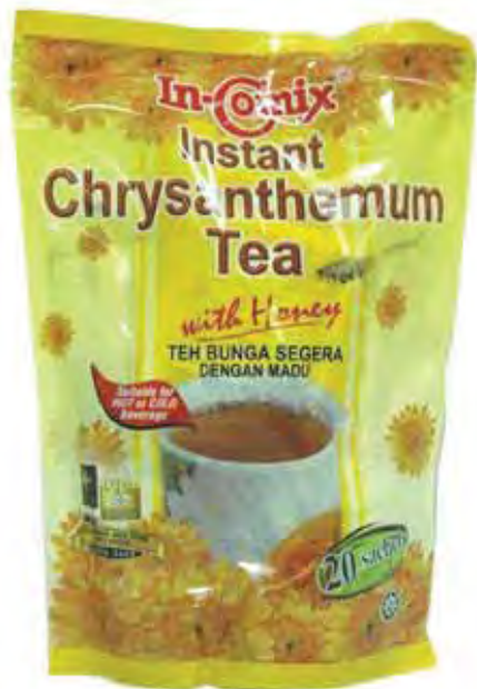
21061 20X18X18GR. INSTANT CHRYSANTHEMUM TEA