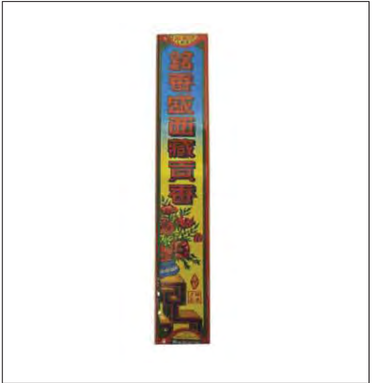
53001 JOSS STICK 1X100BOX