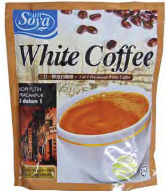
21161 24X15X30GR. WHITE COFFEE (WITH SUGAR)