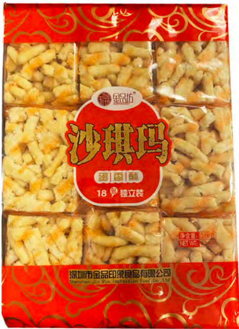
12203 12X518G SOFT FLOUR CAKE (ORIGINAL)