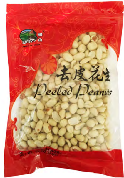
17132 50X12OZ. RICHIN PEANUT W/O SKIN