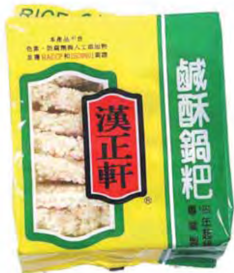
18042 GOUR BAR RICE CRACKER