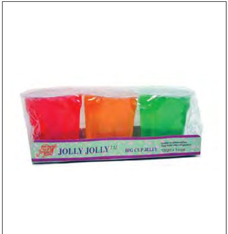
12138 16X3PCS. BIG JELLY CUP PUDDING