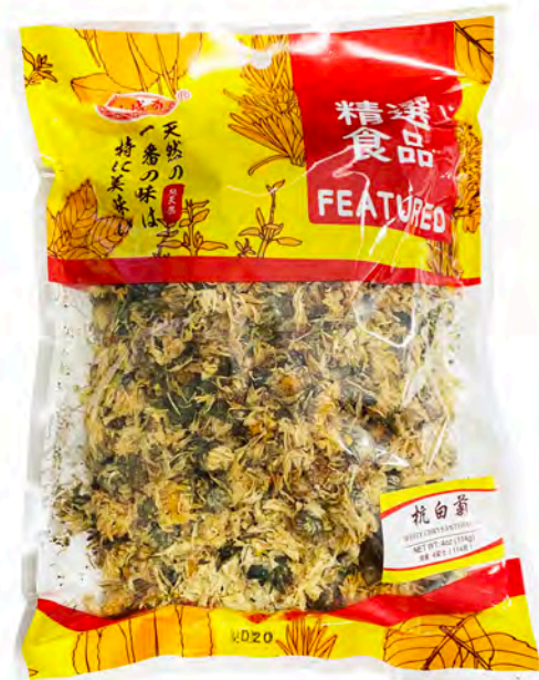
21027 50X4OZ. CHRYSANTHEMUM TEA