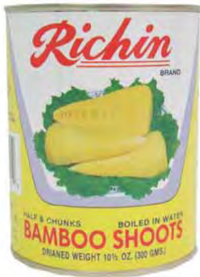
10025 24X19OZ. RICHIN BAMBOO SHOOT (HALF)