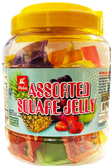
12164 6X1000G. RICHIN ASSORTED SQUARE JELLY