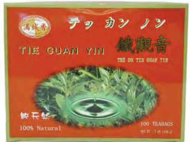
21034 24X100 TEA BAGS AROMA TIE-GUAN-YIN TEA