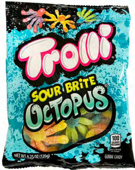
11257 TROLLI OCTOPUS