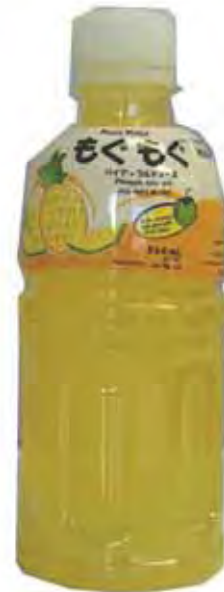
21144 MOGU PINEAPPLE JUICE