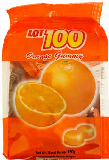
11192 LOT 100 ORANGE GUMMY