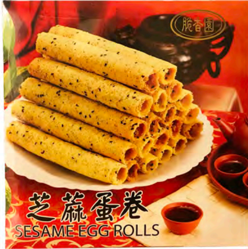
12116 SESAME EGGROLL