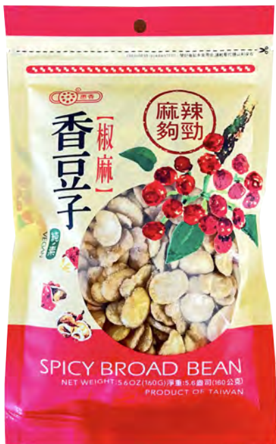
19035 SPICY BROAD BEAN