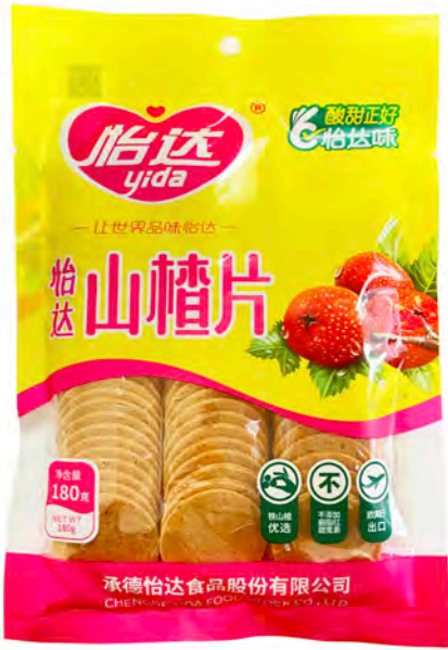
11172 HAWJELLY (ROUND)