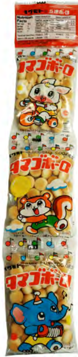
12001 30X3.16OZ. HONEY BALL COOKIES (5PAK)