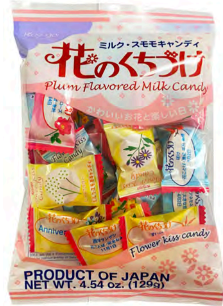
11042 24X5.1OZ. KASUGAI FLOWER KISS CANDY