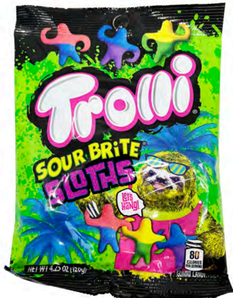
11269 TROLLI SOUR BRITE SLOTHS