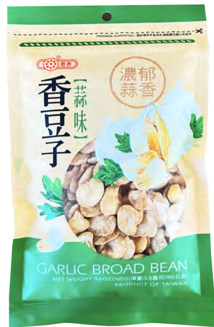
19036 GARLIC BROAD BEAN