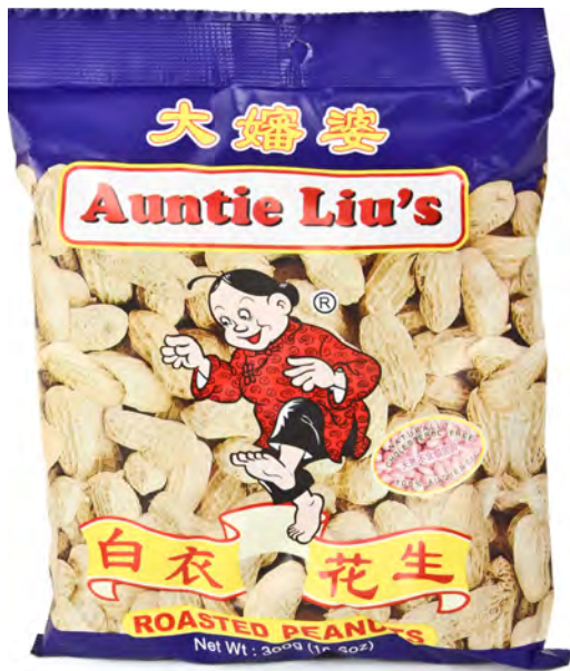
11211 30X300GR. AUNTIE LIU'S ROASTED PEANUT