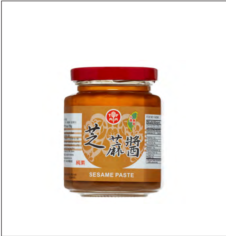
16029 24X9OZ. TF SESAME SEED SAUCE