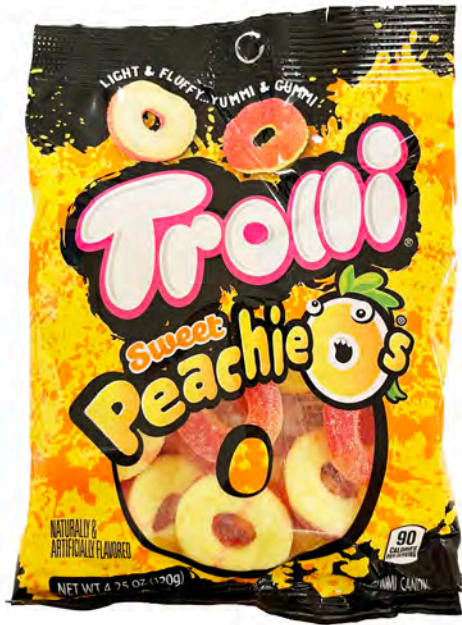
11251 TROLLI PEACHIES