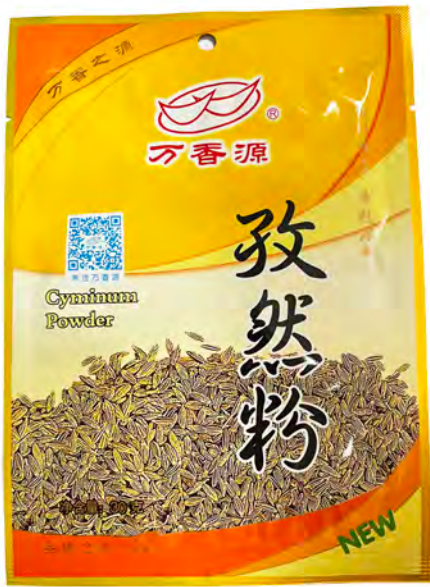
15042 CYMINUM POWDER