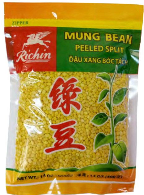
20018 50X14OZ. RICHIN MUNG BEAN (PEEL)