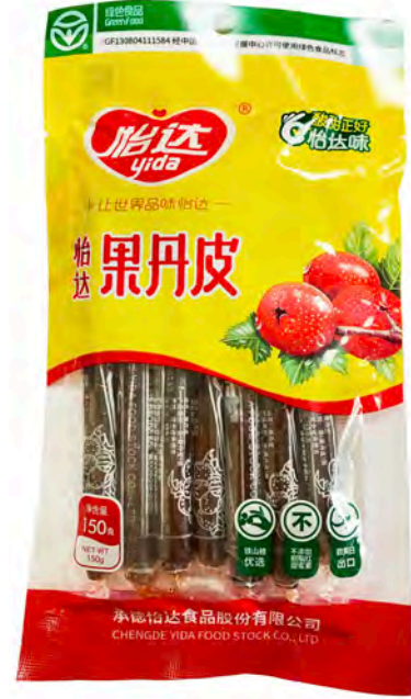
11173 PRESERVED FRUIT OF HAW