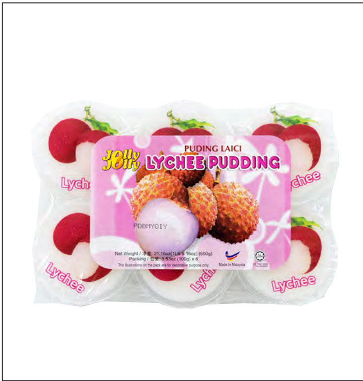
12108 12X6X100GR. LYCHEE PUDDING