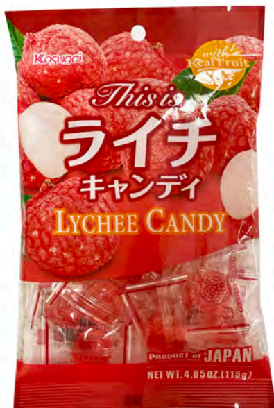
11044 24X4.05OZ. KASUGAI LYCHEE CANDY