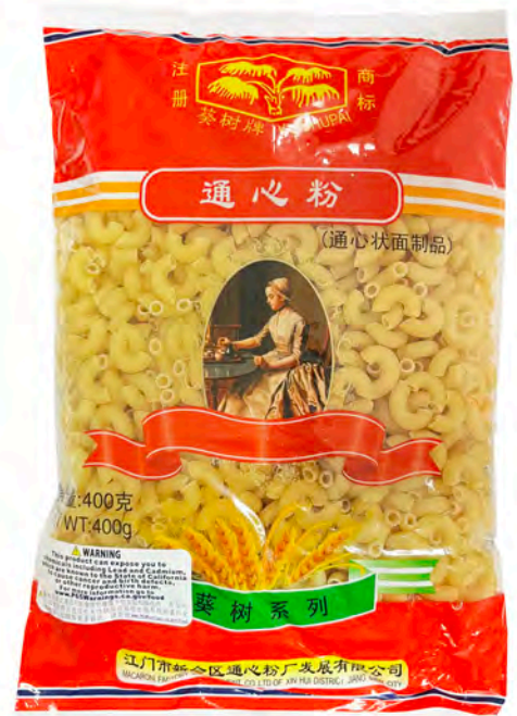
18104 SMALL ARCH MACARONI