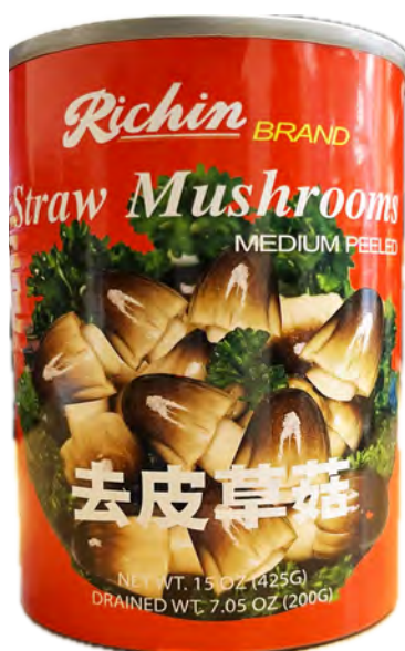
10003 RICHIN PEELED MUSHROOM