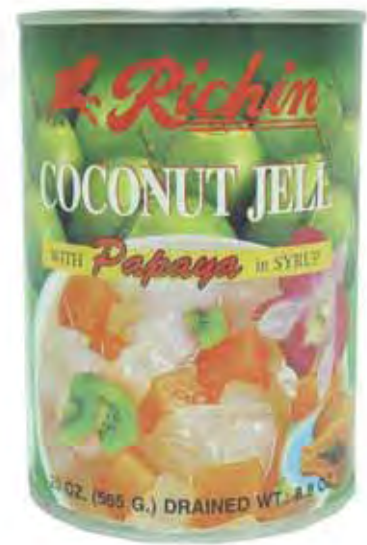
10086 RICHIN COCONUT GEL W/PAPAYA