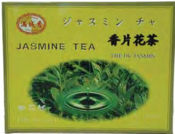
21031 24X100 TEA BAGS AROMA JASMINE TEA (BAG)