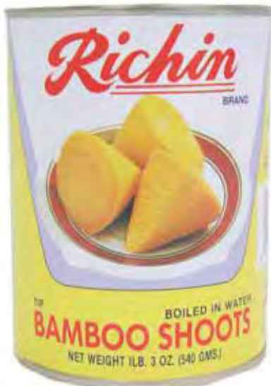
10027 24X19OZ. RICHIN BAMBOO SHOOT (TIP)