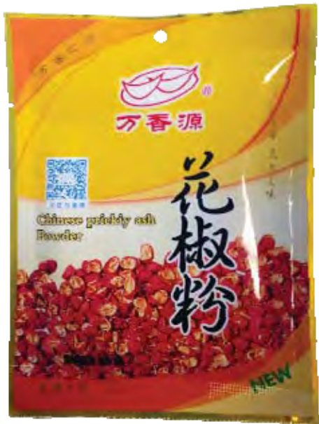
15098 8X25X25GR. CHINESE PRICKLY ASH POWDER