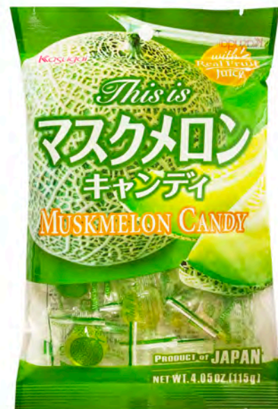
11052 24X4.58OZ. KASUGAI MUSKMELON