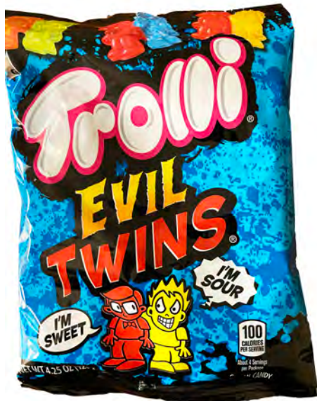
11263 TROLLI EVIL TWINS