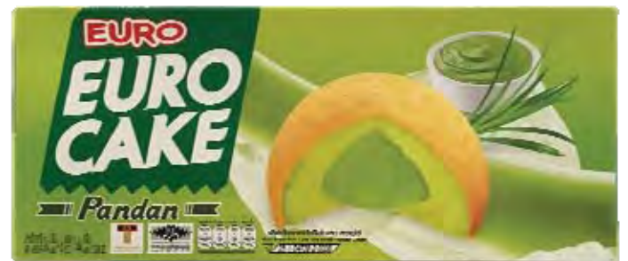
12373 EURO PANDAN CAKE