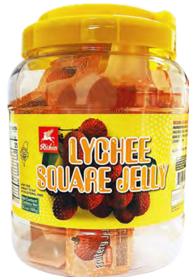
12165 6X1000G. RICHIN LYCHEE SQUARE JELLY