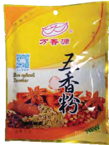
15092 FIVE SPICED POWDER