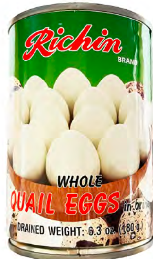
10039 24X15OZ. RICHIN QUAIL EGG