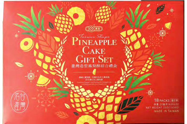
12098 PINEAPPLE CAKE GIFT SET