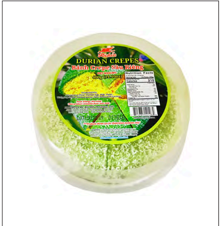
12128 FROZEN DURIAN CREPES