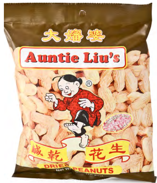
11213 30X300GR. AUNTIE LIU'S DRIED PEANUTS