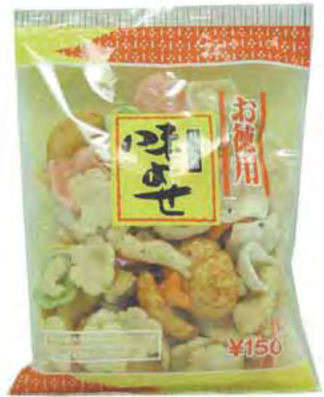
12161 20X3.62OZ WAKABATO CRACKER