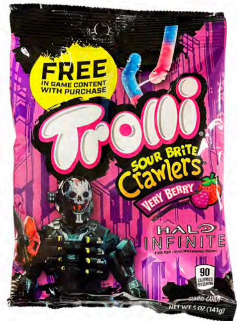
11270 TROLLI VERY BERRY