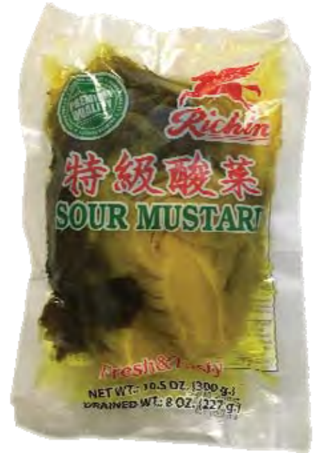
17051 PICKLED SOUR MUSTARD