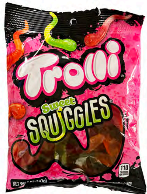
11256 TROLLI SQUIGGLES