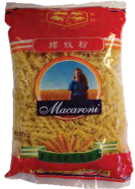
18102 MACARONI (SCREW)