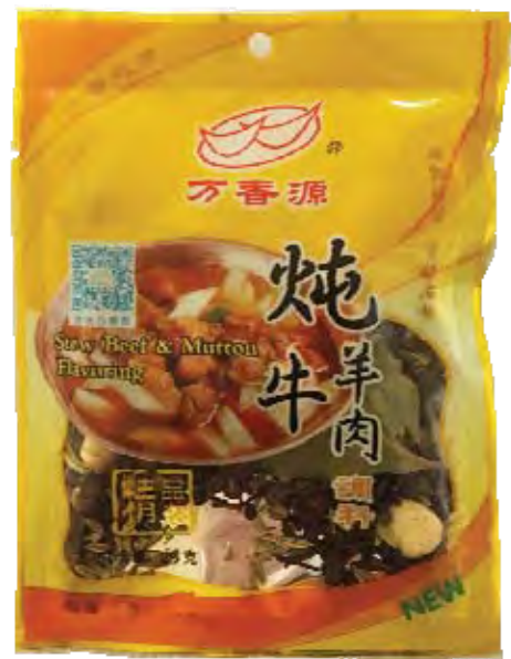
15120 8X20X28GR. STEW BEEF & MUTTON FLAVOR